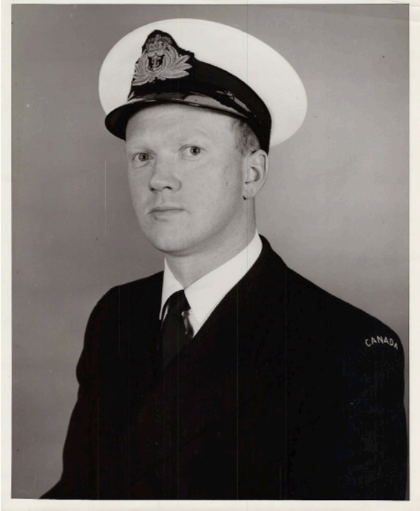
Image 4 My responsible dad. My dad as a young Canadian naval officer, circa 1958.

My parents married during a snowstorm in northern England on December 30, 1961—my ever-practical father states that this date was chosen so that he could claim my mom as a dependent on his tax return that year. My Roman Catholic mother was allowed to be married in her church only if she and my father, an Anglican in the Church of England, promised to raise their children in the Catholic faith. They raised my two siblings and me, yes in the Catholic faith, and then divorced after 27 years of marriage—my mother initiated it saying that she wasn't ready to settle and wanted more. She told me that she wanted someone to hold her hand again. I thought that was strange, as I had never seen them hold hands. But