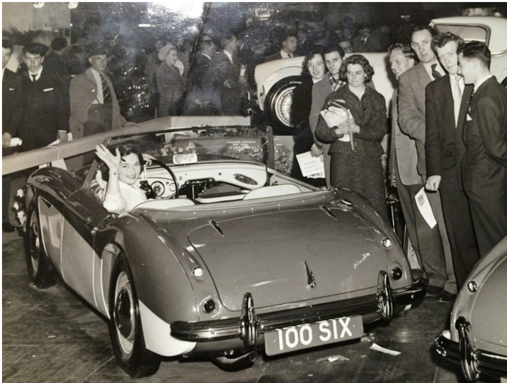
Image 3 My glamorous mother. That’s my mom in the car as a “cigarette girl” at a car show, circa 1958.

The portrait I hold of my mother is one of glamour, adventure, and liberal thinking: in my memory she was gregarious and full of passion, but also one never to leave the house without “putting on her face”—or make-up. My father’s influence on me, by contrast, was one of practicality, mindful of doing one’s duty, “One must not only be honest”, he would say, “but also appear honest”. The two photos below capture the images that I hold of my parents: my glamorous mother and my responsible father.