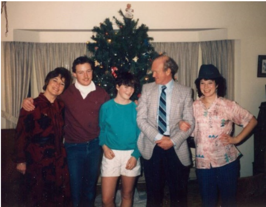
Image 2. The family Christmas photo, that's me on the right wearing my dad's hat, 1980.