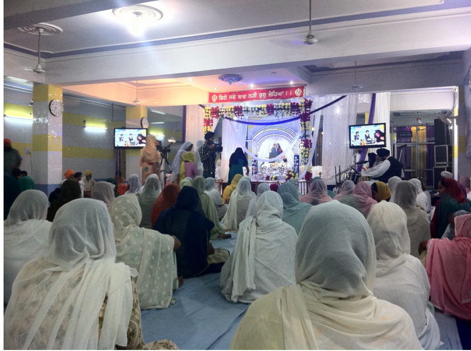
Figure 5.4 The congregation at the Akhand Path