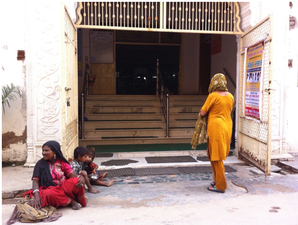
Figure 4.1 Entrance to the Shaheedganj Gurdwara

in the community (skirts, known as lehengas , and silver jewellery as opposed to the loose pants and tunic known salwar-kameez ), it did not seem she was Punjabi, or Sikh. Indoors there are a number of blue signs advertising messages related to the gurdwara. Like most other gurdwaras, one must cover their head and take off one's shoes and wash their hands and feet, although the small pool of water reserved for dipping one's feet is generally dry here.