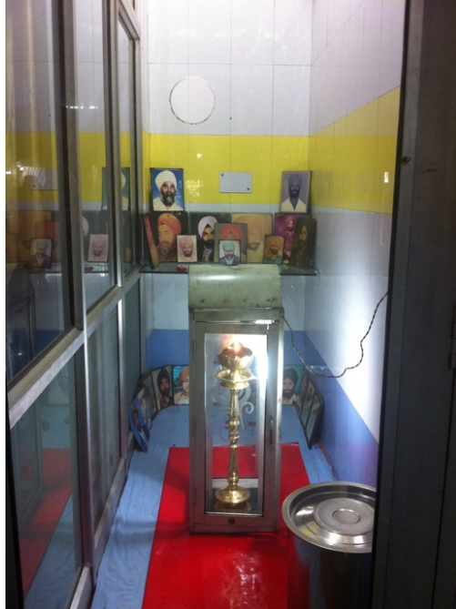
Figure 5.3 Photographs and oil lamp at the Shaheedganj Gurdwara

Most of the women I spoke to had photographs of relatives killed in the massacre in their homes. It is in fact common in households across North India to keep photographs of deceased relatives in living spaces. In some Hindu rituals particularly, photographic portraits hold an elevated status and are used in puja rooms in rituals as signs of elders, often adorned with garlands of flowers or a red mark on the forehead, known as a tilak . 166 These intimate forms of portraiture and their placing underscore the importance of the role of the dead in ritual, religious practice, and everyday life in the colony. Thus, photographic memorial portraiture allows traces of the dead to endure (Pinney 1997). Memorialization of the dead through photographic practice in the home has been noted to be a gendered phenomenon involving women in European contexts in that women are often responsible for organizing the domestic space and thus