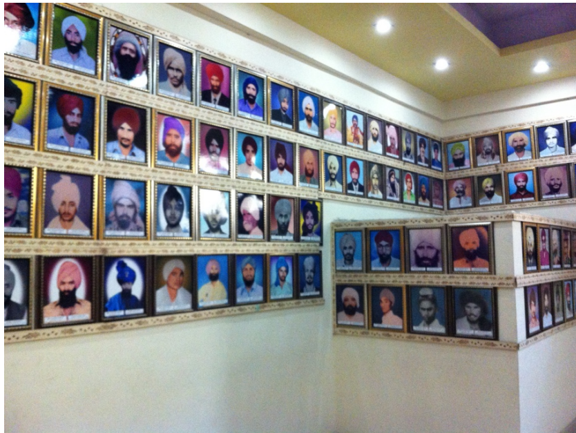
Figure 5.2 Photographs of men killed in the 1984 massacre at the Shaheedganj Gurdwara

As a keen outside observer, the stylized nature of the images and their large numbers often made me to think about the possible histories behind each photograph. What circumstances preceded each photo being taken? And what circumstances led to such overpainted versions here, on this wall, alongside so many others? For the families of the boys and men on the walls, there are personal stories behind the photograph – the photograph was taken at x time, at y place. But to the outsider, at first glance, it is a commemorative marker of the collective event, especially because it has been placed alongside portraits of numerous other men who died by the same fate.