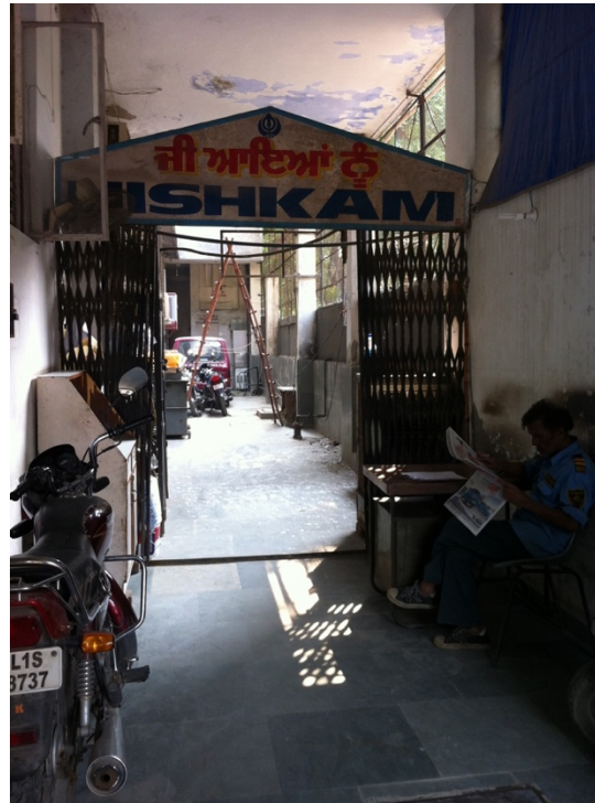
Figure 3.1 Inner entrance to Nishkam Bhawan

area across the street from Nishkam (now generally used for parking) shortly after the massacre until other jobs were procured.