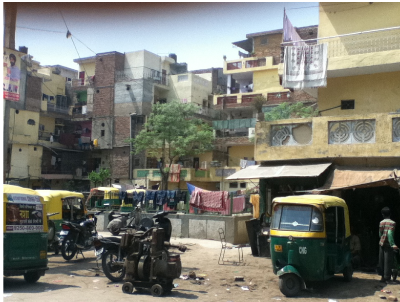
Figure 1.2 The flats of Tilak Vihar as seen from the main thoroughfare

her hair expertly oiled and fashioned into a long braid. Her mother had worked in Nishkam from its inception. Surjit’s movements around the neighbourhood were indicative of the spatial segregation of caste. On a sunny day in March of 2013, Surjit and I had hired a rickshaw for an hour to take us around the Tilak Vihar neighbourhood so we could devise a rough map of the main streets and buildings. After circling around the main market and Tilak Vihar’s Blocks B and C, I indicated to Surjit that we should cross the street and circle around Block A, adjacent to Nishkam. “No... we can’t go there,” she said. “Why not?” I asked, “It’s just across the street.” “Backward people live there.” “What do you mean?” I was surprised by her answer. “You know, backward people,” she said dismissively, with a wave of her hand. “I’ve never gone there.” The term backward log , or backward people, is often used by upper and middle-class Indians to describe India’s lower castes, particularly Dalits. In addition to this spatial segregation, it seemed to me that much of the administrative staff and board members of Nishkam were all from middle and higher castes.