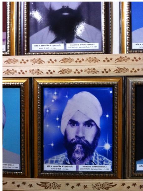
Figure 5.1 Stylized background in a photograph of a Sikh man killed in the massacre

Entering the small room to the right side of the entrance of the central prayer court, known as the darbar 164 hall, one is faced with photographs of those who were killed in 1984. The men in the photographs range in age, from portraits of children to the elderly. All of the men are wearing various head coverings commonly worn by Sikh men and boys, such as turbans or cloth covering their topknots, their faces frozen in time; some smile broadly whereas others' expressions are more neutral. The edges of their bodies have been stylized and softly blurred; the bodies themselves have been coloured, some black and white, while others are rendered in a gaudy technicolour. The backgrounds of the photographs are mostly solid, with some lightening of shade in the middle to form a halo effect. A few of the photographs have more stylized