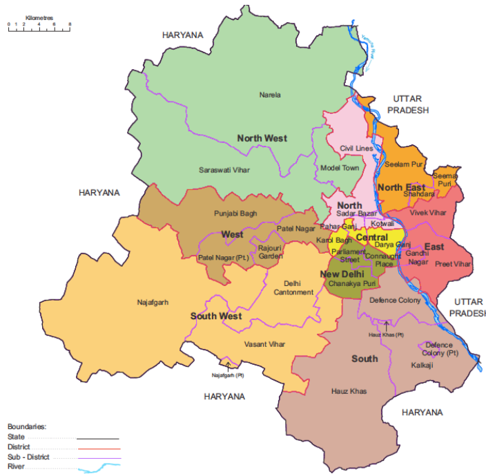
Figure 1.3 Current administration divisions of Delhi (Government of India 2013)

The landscape of contemporary Delhi in the 20 th and 21 st centuries has come about through a few key factors: the British attempt to tame the perceived chaos and disorderly nature of the city through caste and class segregation, Partition’s effect on religious segregation in the city, and more recent attempts to destroy slum housing and displace poor Delhiites in the name of neoliberal modernization and beautification. The British view of Delhi at the turn of the century outlined the city as too dangerous, too unruly; it was a space that needed to be controlled, especially during incidences of rioting or communal or religious processions. Thus, Delhi was planned as an ideal imperial capital and a symbolic showcase for modernity in the 20 th century