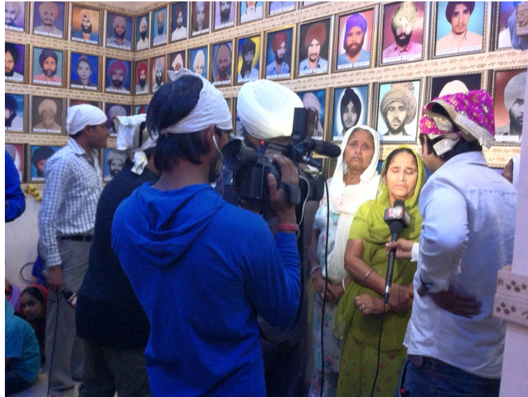
Figure 5.5 Journalists interviewing widows at the Shaheedganj Gurdwara

They decided to conduct interviews in the memorial room with the photographs of the deceased acting as a backdrop, thereby engaging with potent visual cues of the violence and women's relationships to those who had passed. I witnessed one of the widows becoming extremely agitated and upset on camera, almost as if on cue, only to return to a calmer state as soon as the cameras turned off.