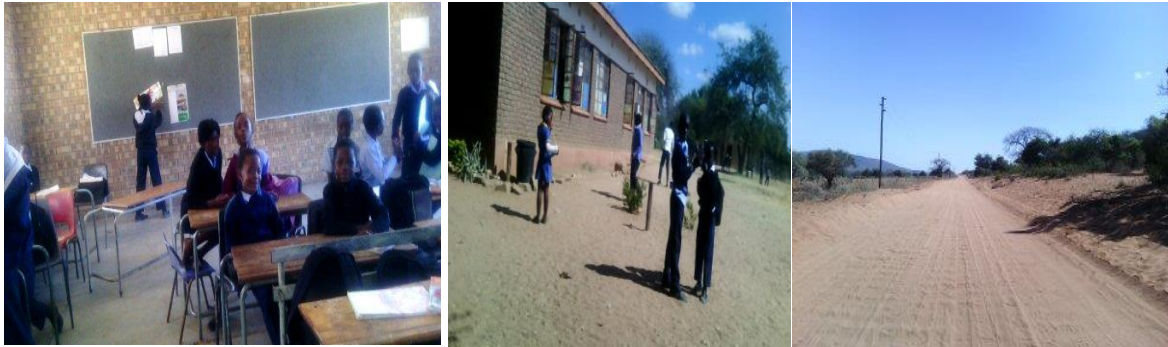
Figure 6: Some features of School B

On the left are Grade 4s during a maths lesson. In the centre are learners during break time. On the right is the road the learners travel daily from home to school .