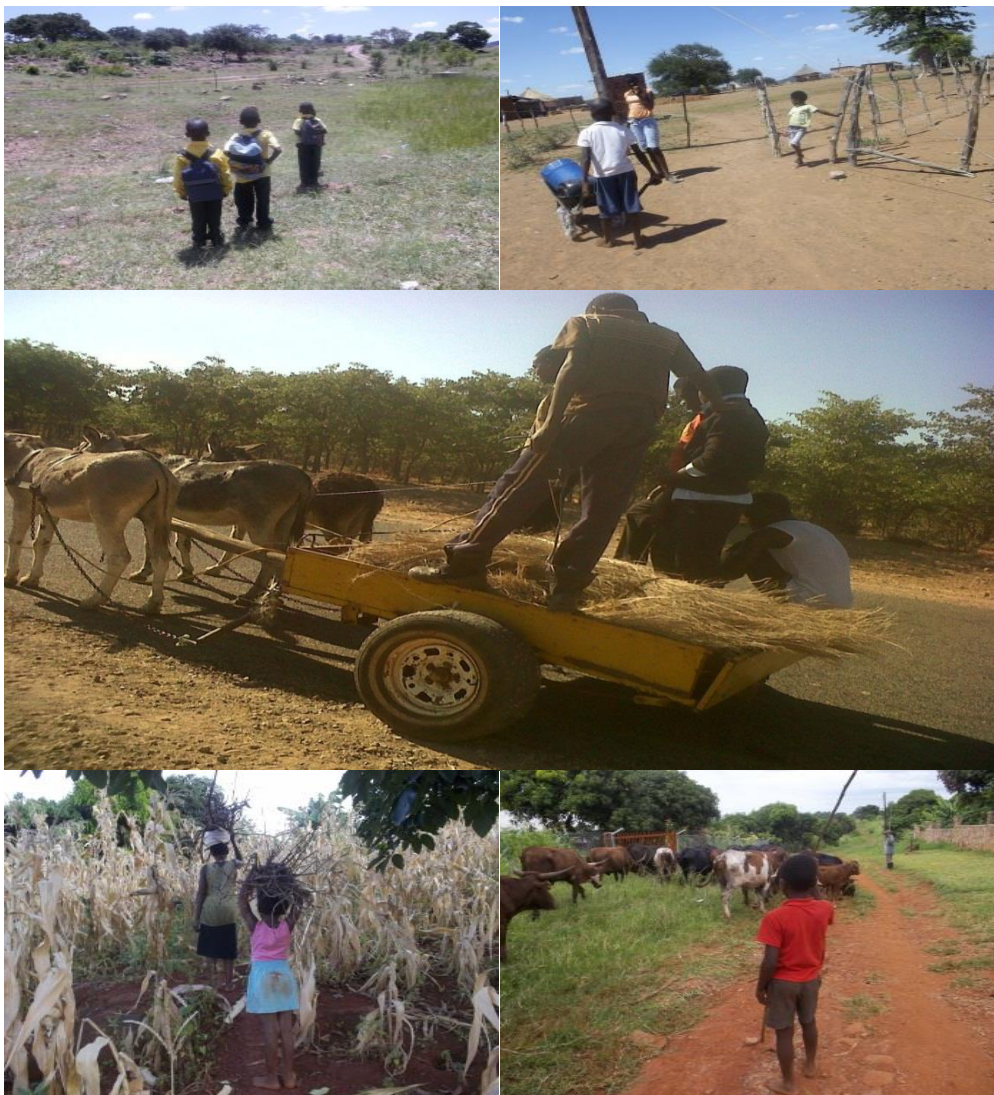
Figure 3: Activities in the rural area of Niani

People in deep rural areas usually have to struggle in order to reach modern facilities, for example big supermarkets, banks and entertainment centres. There is a lack of transport and people spend much money to travel to such destinations. Although most of the schools in the area have been provided with new classrooms, the old classrooms are still in use owing to the increase in learner enrolment. Some of these schools have electricity and some make use of solar power. For sanitation these schools use pit toilets. Although there are water pipelines, they are usually dry and therefore the schools depend on boreholes. Most learners travel in excess of three kilometres on foot in order to get to school. In addition, they have to perform domestic chores after school, for example collecting firewood, taking care of the herds and fetching water from some distance away.