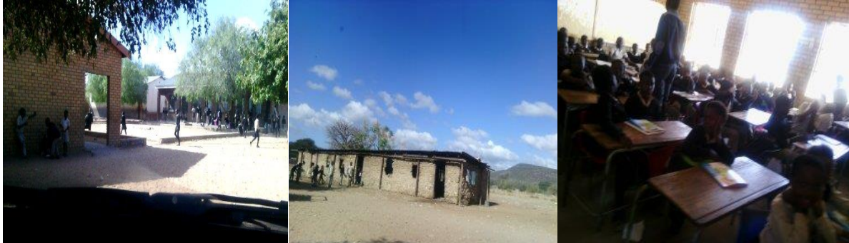
Figure 5: Some features of School A

schools was assured. My assistant helped me with the recording. No other challenges have I noticed either than that of linguistic.