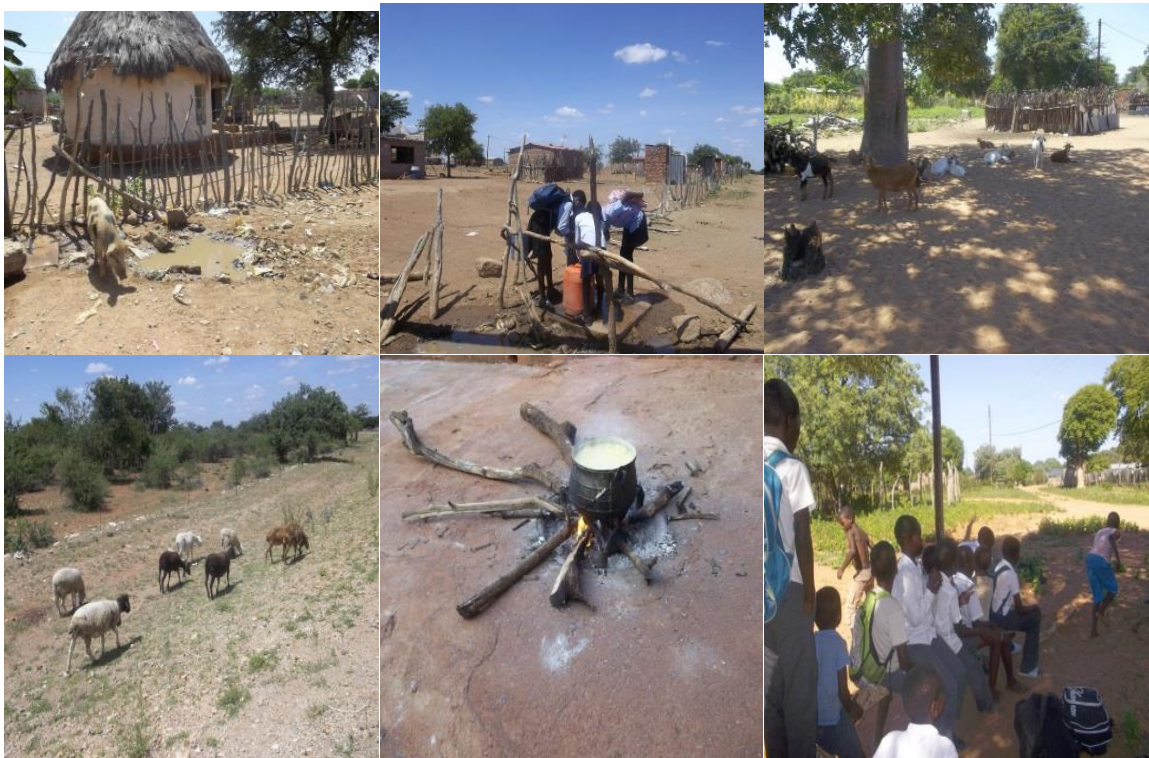
Figure 4: Some of the features of the rural area around Niani

The community depends on natural resources such as wood as a source of energy, as well as depending largely on livestock for subsistence. They also trade mopani worms and firewood. Teachers in the rural areas usually reside in the local communities, although some reside in nearby townships, which are also monolingual areas. These teachers are mother tongue speakers of Tshivenda.