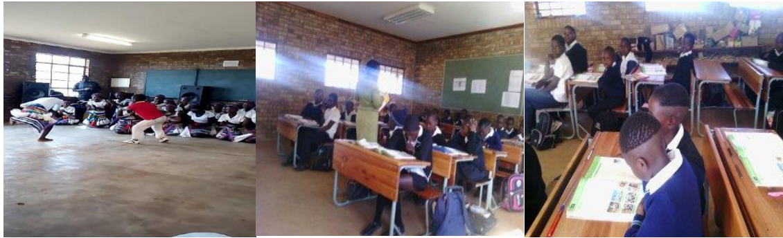
Figure 7: Some features of School C

teachers and learners while changing classrooms at the end of the period. All communications were done in Tshivenda.