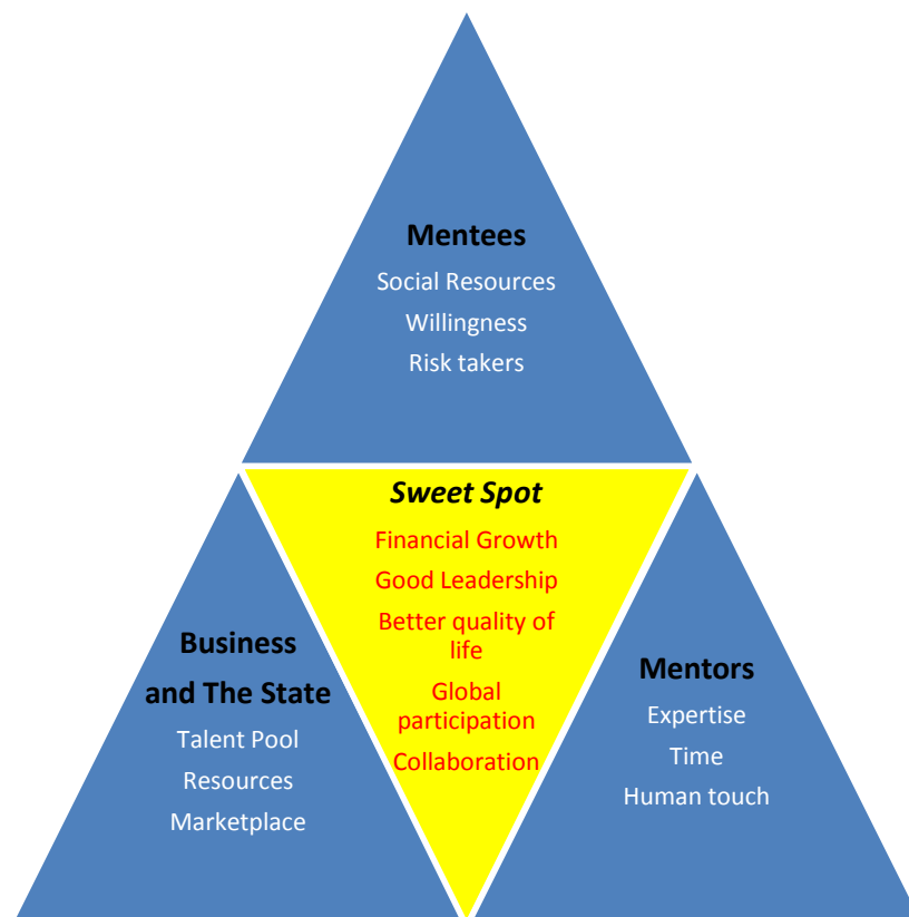
Figure 2: Mentoring and Networking Model

In addition to some of the benefits of mentoring and networking already discussed earlier some additional ones include economic growth, increased incomes, improved standards of living for people, increased investment opportunities, enlargement of the country's tax base by a greater number of new firms, technological developments driven by innovation and increase in job opportunities. An issue that was raised was that the quality of leaders raised from this process is far richer than could have been imagined.