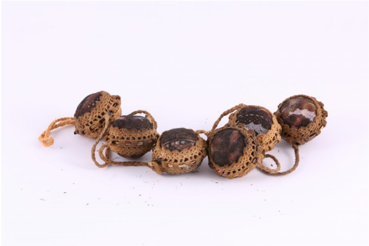
Figure 24. Joani Groenewald, Object (2014). Lace, tea strainers, thread and rooibos tea. Digital photograph.