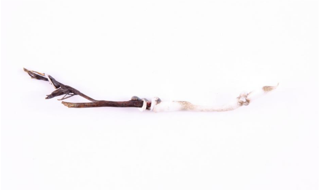
Figure 16. Joani Groenewald, Object (2014). Brass and lamp work glass. Digital photograph.