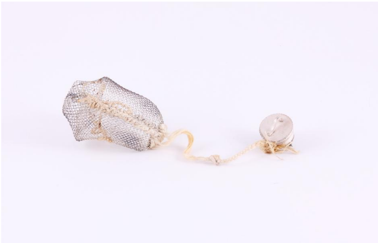
Figure 5. Joani Groenewald, Teesiffie #2 (2013). Brooch: Lace, thread, silver, tea strainer, roibos tea. Digital photograph.