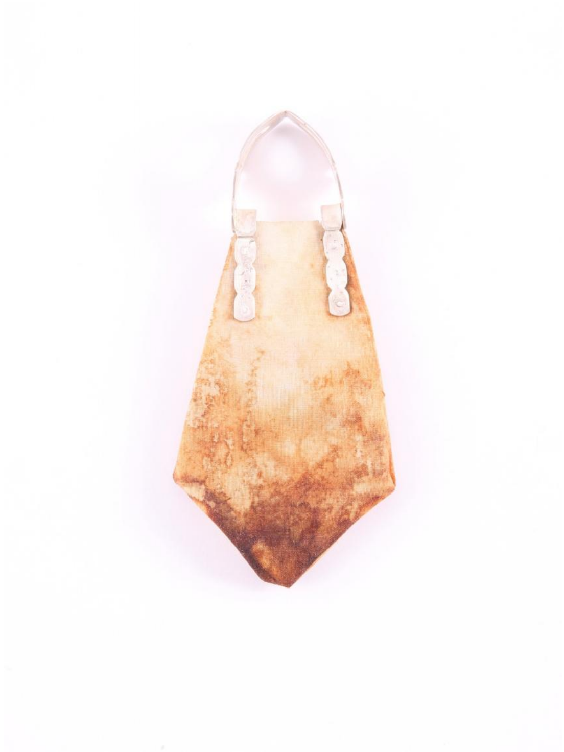
Figure 8. Joani Groenewald, Teesakkie #1 (2013). Pendant: Antique napkin, silver, rooibos tea. Digital photograph.