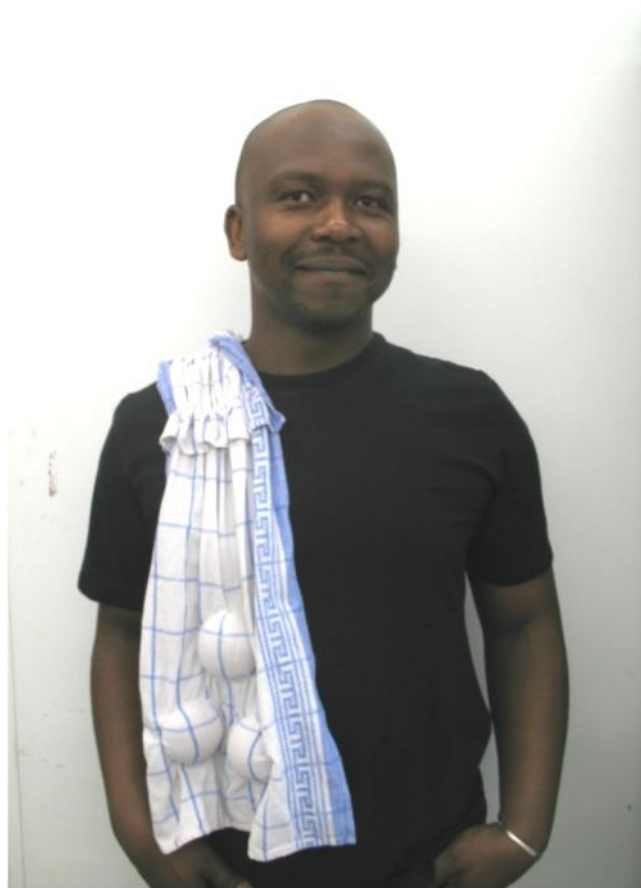
Figure 28. Nini van der Merwe, Blue and white #1 (2011). Neckpiece: Cotton, silk thread, upholstery foam, wood. (Van der Merwe 2013).