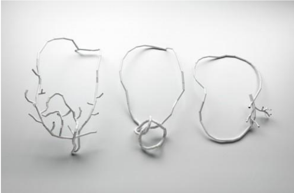
Figure 35. Xylem (2013) Neckpieces: Powder coated brass and copper chenier vary. (Jess Dare [Online]).