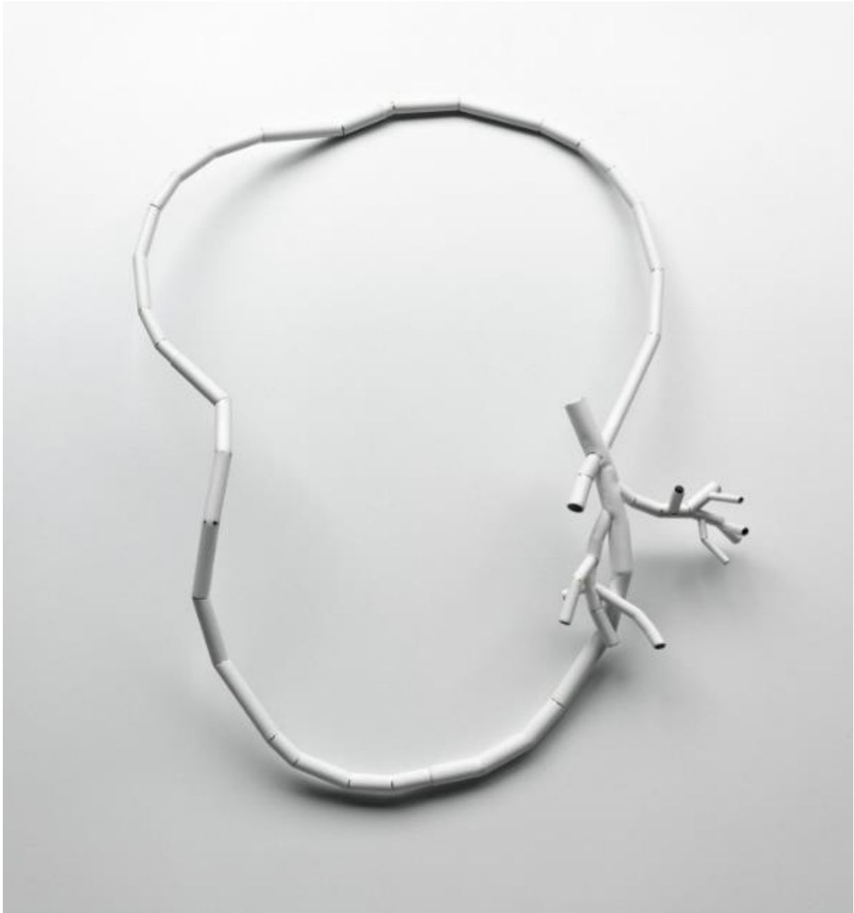
Figure 36. Xylem (2013) Neckpiece: Powder coated brass and copper chenier vary. (Jess Dare [Online]).