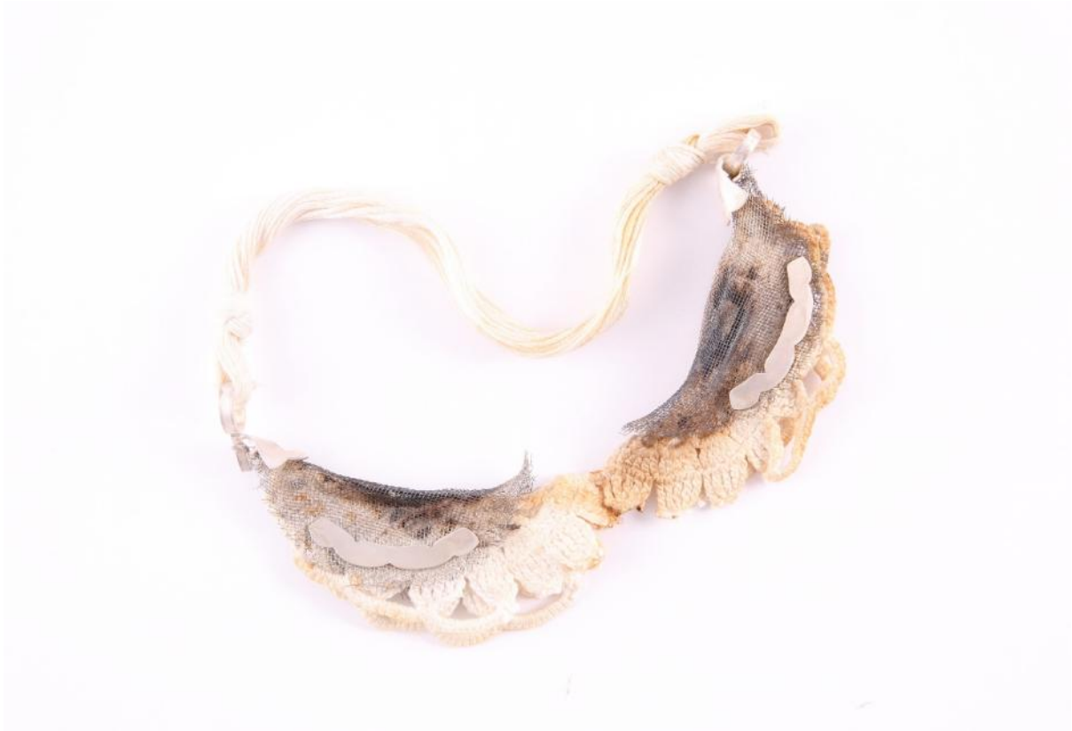
Figure 12. Joani Groenewald, Borslappie #2 (2013). Neckpiece: Lace, thread, silver, tea strainers. Digital photograph.