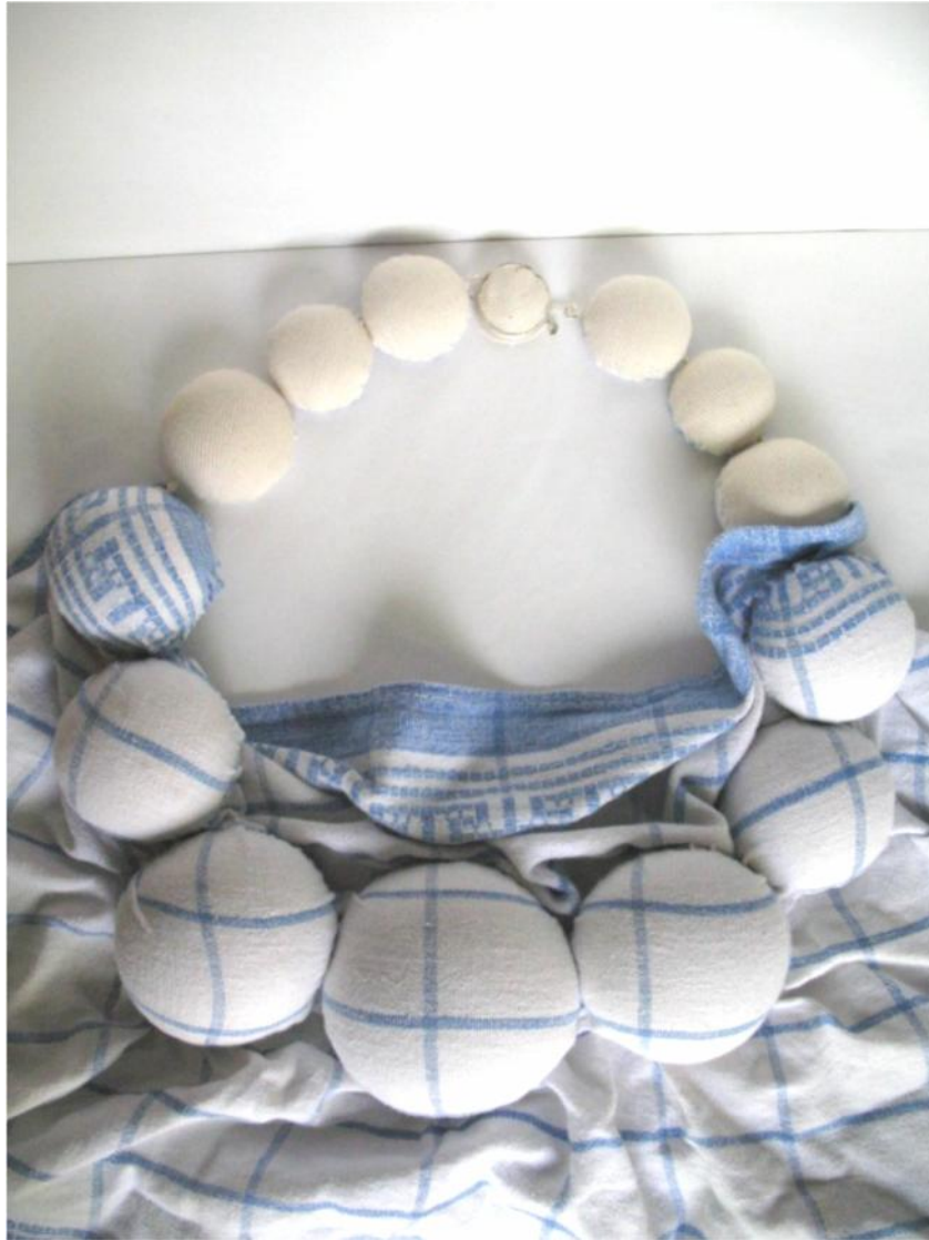
Figure 27. Nini van der Merwe, Blue and white #2 (2011). Neckpiece: Cotton, upholstery foam, wood, sterling silver, silk thread. (Van der Merwe 2013).