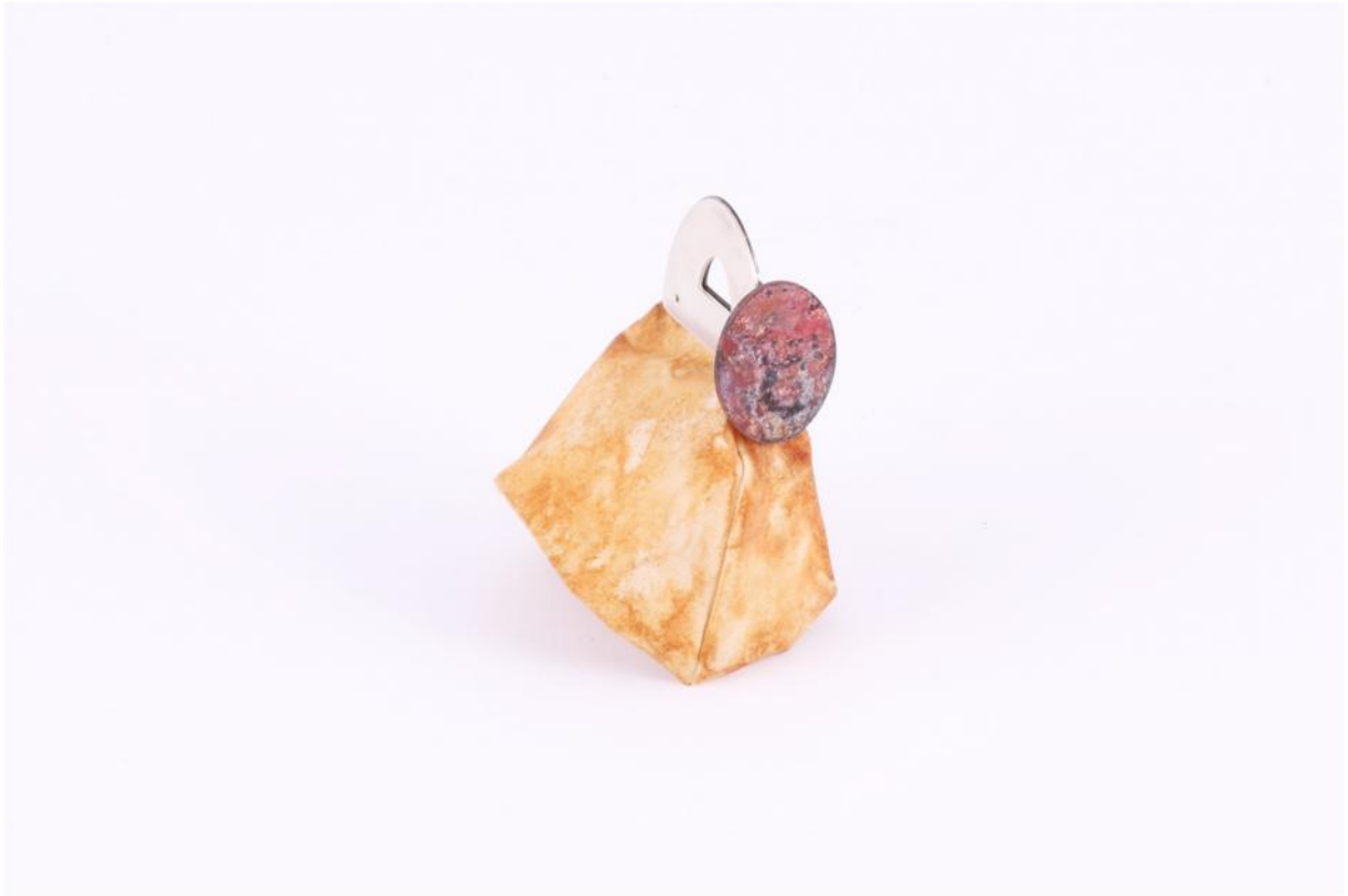
Figure 7. Joani Groenewald, Teesakkie #1 (2013). Pendant: Antique napkin, silver, rooibos tea. Digital photograph.