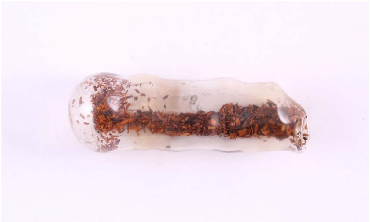
Figure 20. Joani Groenewald. Rooibos #3 (2014). Glass Rooibos tea. Digital photograph.