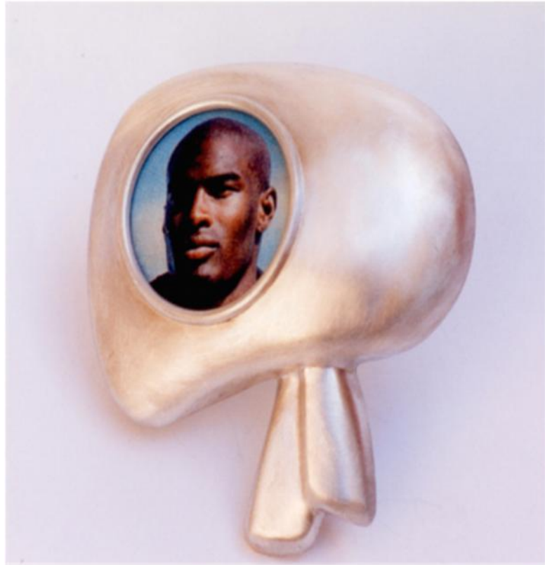
Figure 25. Carine Terreblanche, Die Kappie (1999). Brooch: Silver, photographic image. (Burger 2013).