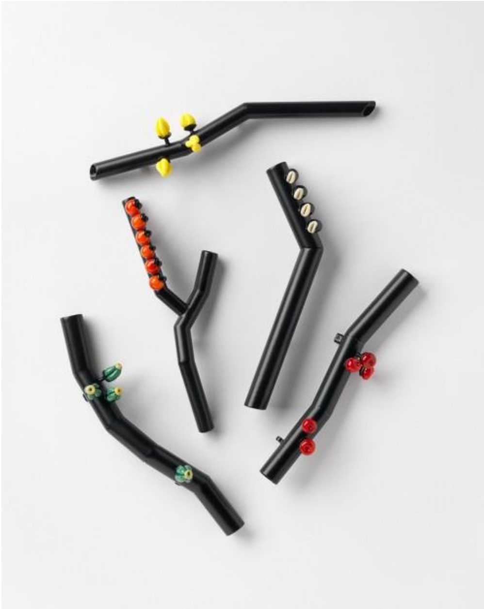
Figure 38. Jess Dare. Epicormic series (2013). Brooches: Powder coated brass and copper, sterling silver, lampwork glass, stainless steel vary. (Jess Dare [Online]).