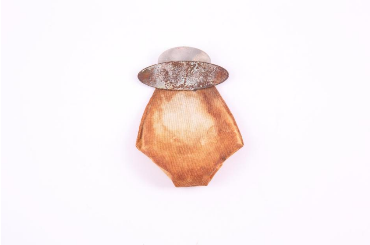
Figure 10. Joani Groenewald, Teesakkie #1 (2013). Brooch: Antique napkin, silver, rooibos tea. Digital photograph.