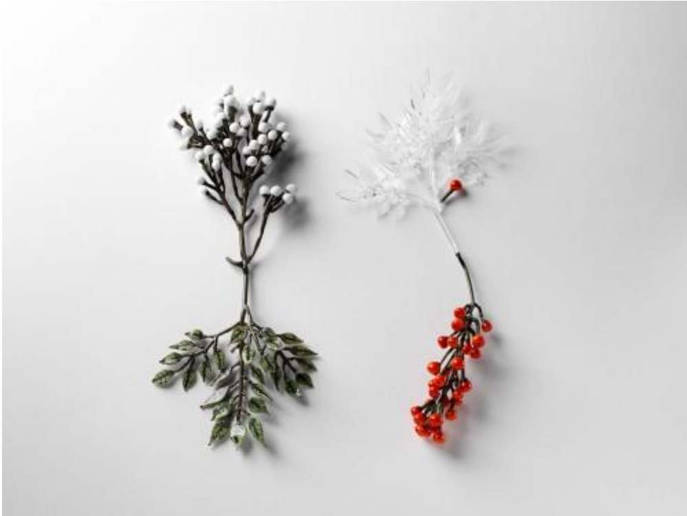
Figure 31: Jess Dare. Conceptual flowering plant series (2013). Object: Lampwork Glass.

Photography by Grant Hancock. (Jess Dare [Online]).