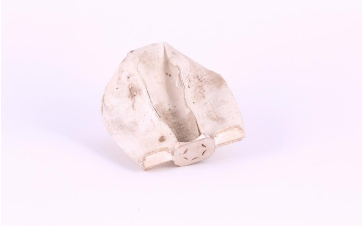
Figure 13. Joani Groenewald, Object (2013). Linen, paper and silver. Digital photograph.