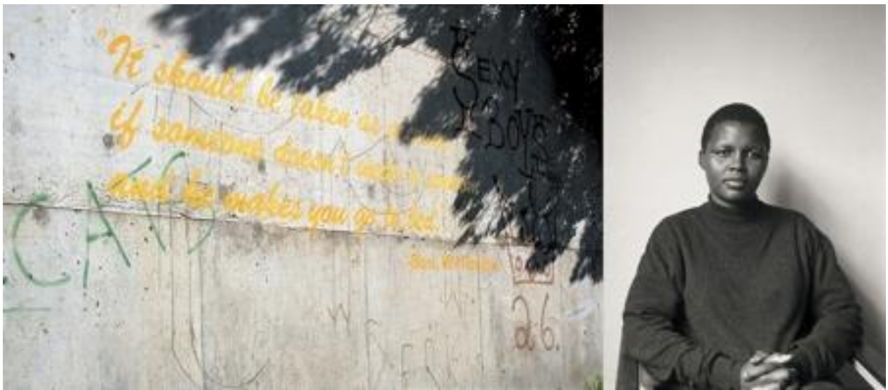
Figure 26. Sue Williamson. From the inside - Busi (2000). Dibond print 90 x 200 cm. (Goodman Gallery [Online]).