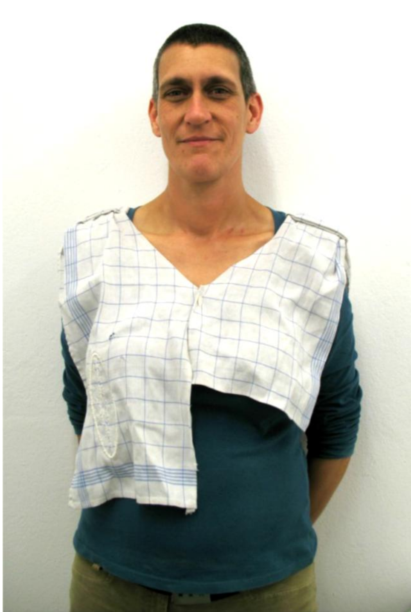
Figure 29. Nini van der Merwe, Blue and white #3 (2012). Cotton, silk thread, sterling silver. (Van der Merwe 2013).