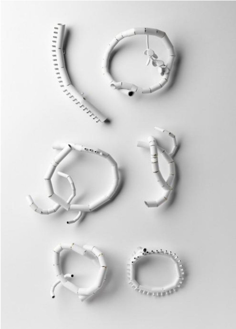
Figure 37. Xylem (2013). Brooches: Powder coated brass and copper chenier vary.

Photography by Grant Hancock. (Jess Dare [Online]).