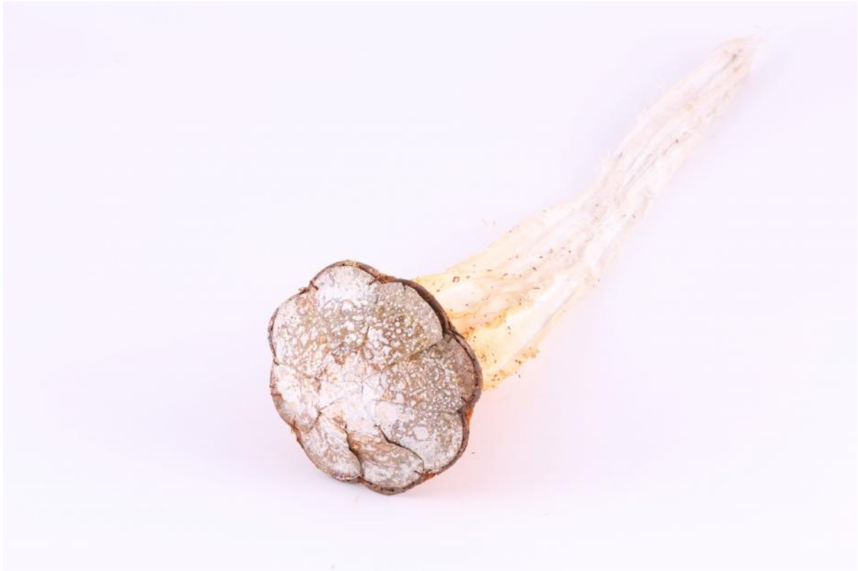
Figure 22. Joani Groenewald, Object (2014). Enamel, silver, copper, linen and rooibos tea.