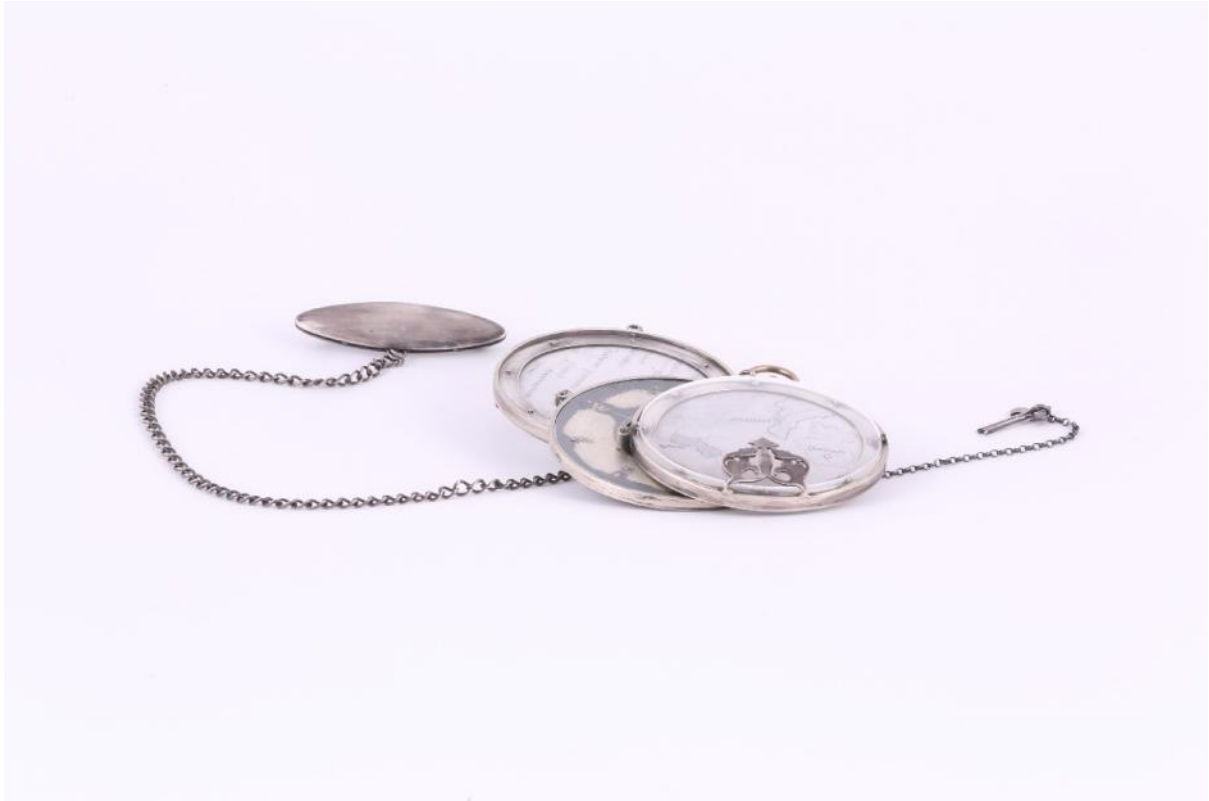
Figure 3. Joani Groenewald, Brooch (2012). Silver, 9ct rose gold, paper and plastic. Digital photograph.