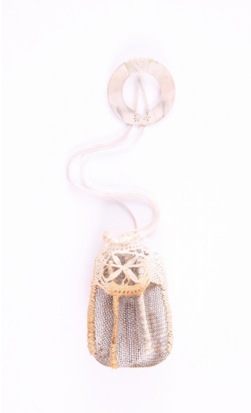
Figure 4. Joani Groenewald, Teesiffie #1 (2013). Brooch: Lace, thread, silver, tea strainer, rooibos tea. Digital photograph.