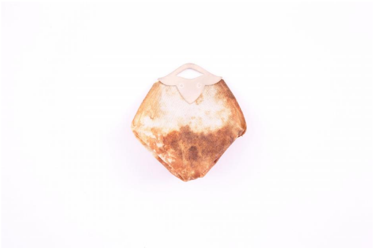
Figure 9. Joani Groenewald, Teesakkie #1 (2013). Brooch: Antique napkin, silver, rooibos tea. Digital photograph.