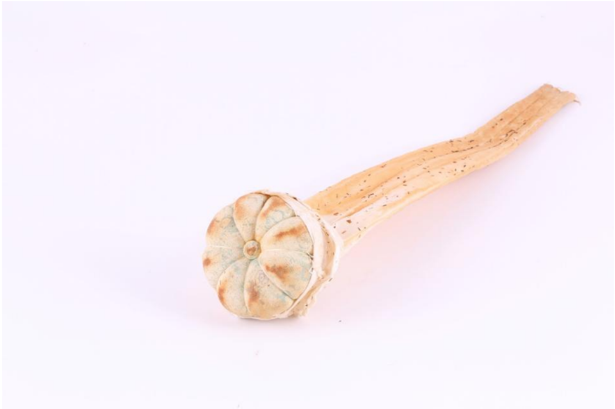
Figure 23. Joani Groenewald, Object (2014). Linen and rooibos tea. Digital photograph.