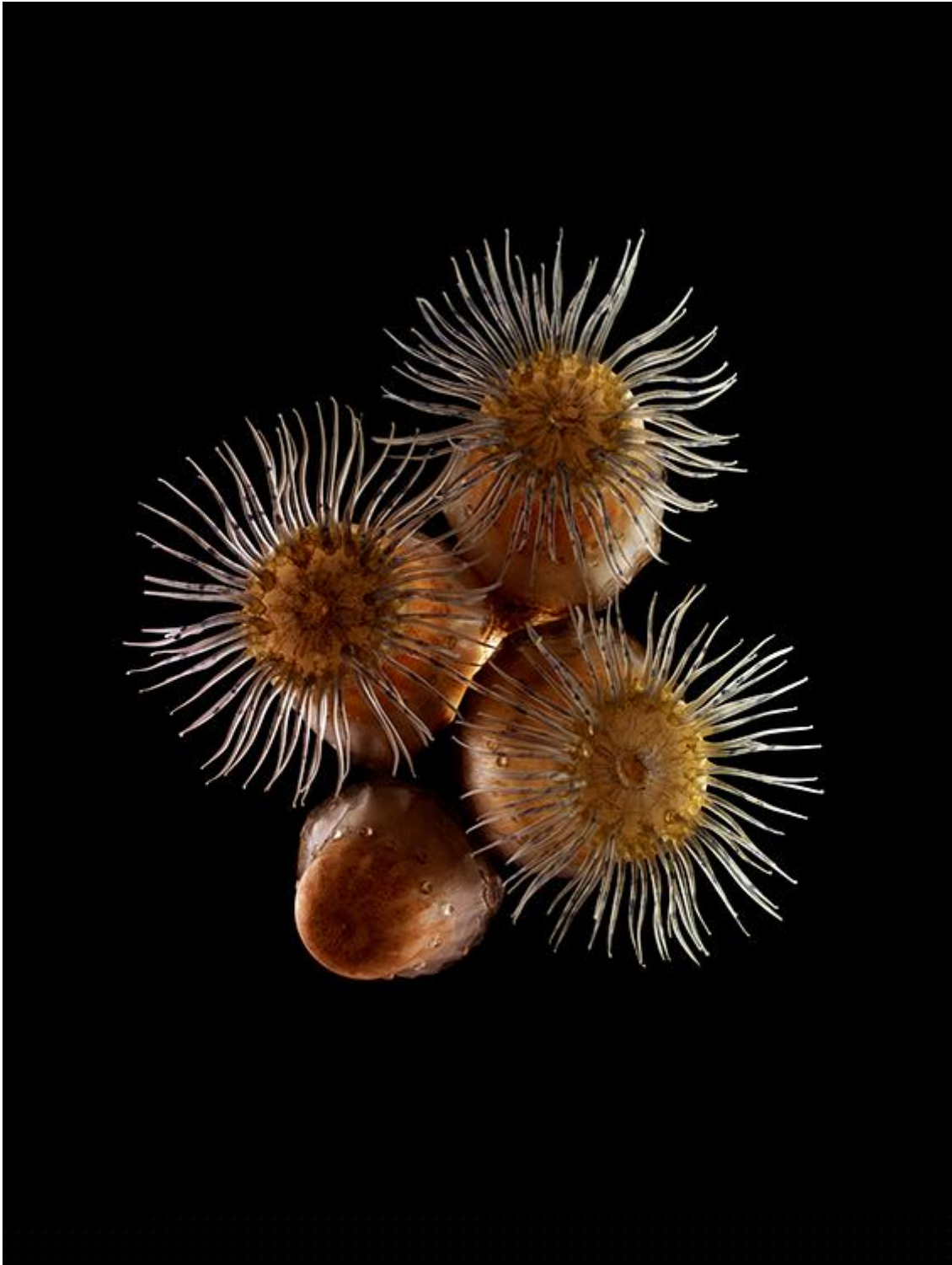
Figure 34. Leopold and Rudolf Blaschka. Calliactis Decorata . Object: lampwork glass. (Guido Mocafo [Online]).