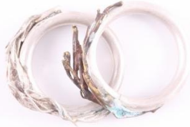
Figure 14. Joani Groenewald, Rings (2013). Silver and brass. Digital photograph.