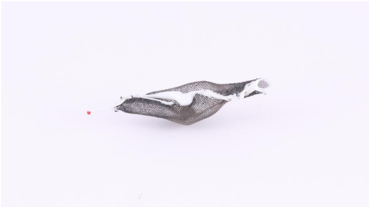
Figure 21. Joani Groenewald. Object (2014). Lamp work glass and steel mesh. Digital photograph.