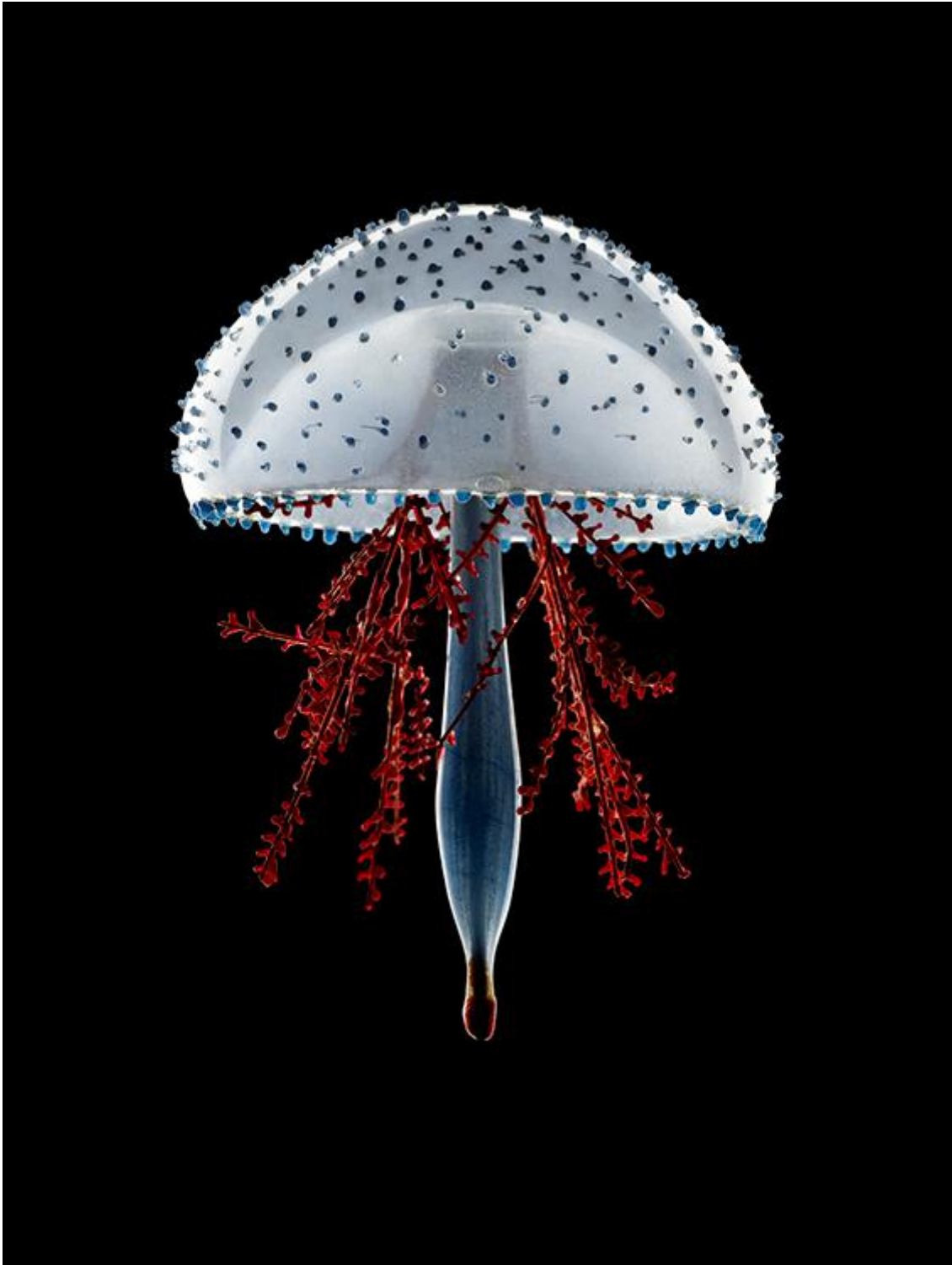
Figure 33. Leopold and Rudolf Blaschka. Lymonorea Trieda . Object: lampwork glass. (Guido Mocafigo [Online]).