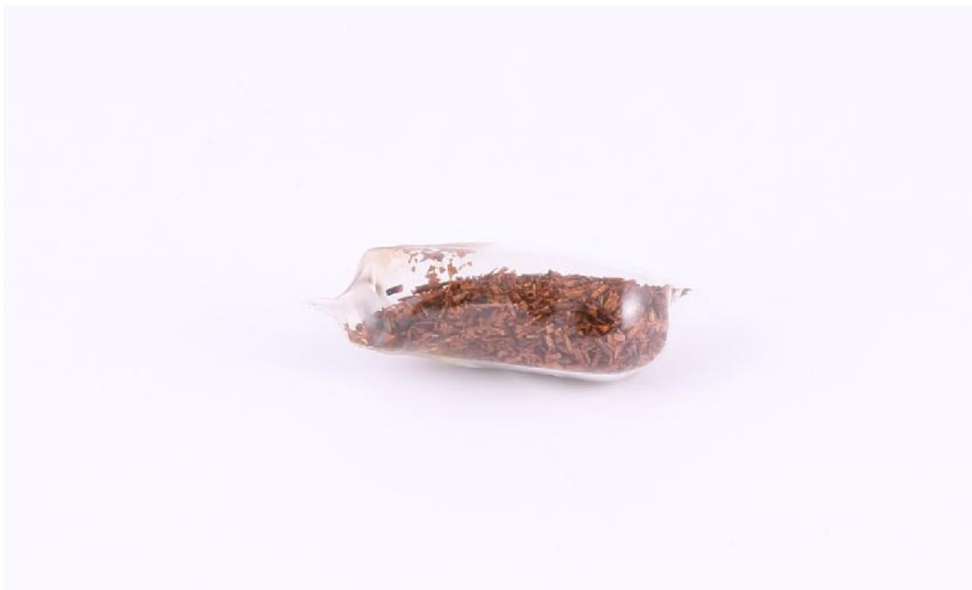
Figure 19. Joani Groenewald. Rooibos #2 (2014). Glass Rooibos tea. Digital photograph.