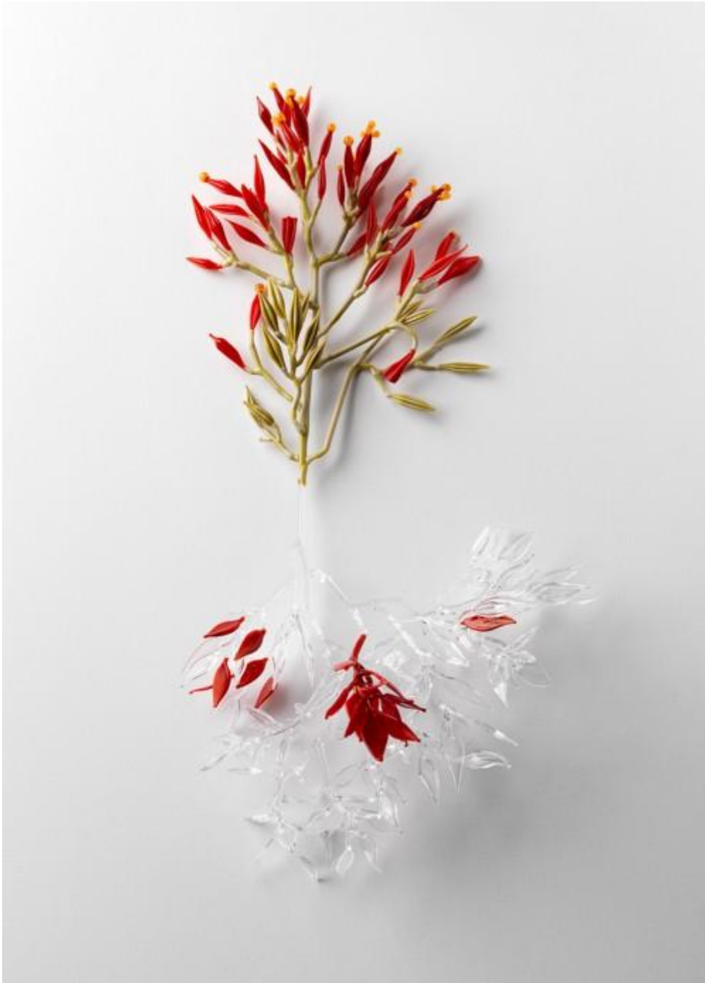
Figure 30: Jess Dare. Conceptual flowering plant series (2013). Object: Lampwork Glass.

Photography by Grant Hancock. (Jess Dare [Online]).