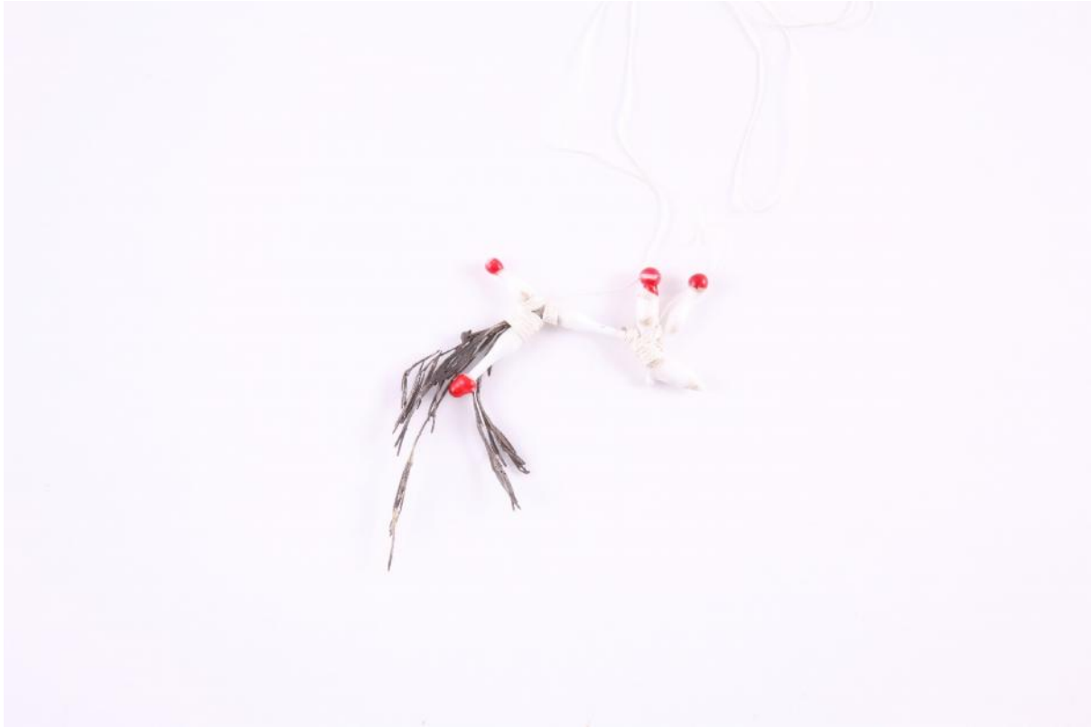
Figure 17. Joani Groenewald, Object (2014). Silver, thread and lamp work glass. Digital photograph