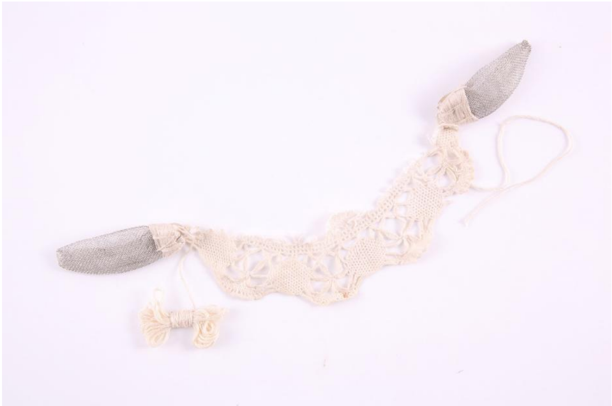
Figure 11. Joani Groenewald, Borslappie #1 (2013). Brooch/neckpiece: Lace, thread, silver, tea strainers. Digital photograph.