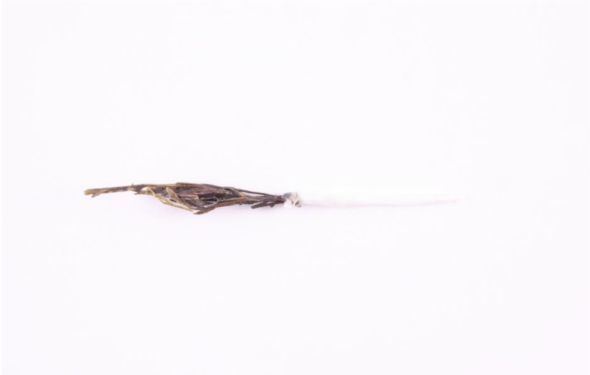
Figure 15. Joani Groenewald, Object (2014). Brass and lamp work glass. Digital photograph.