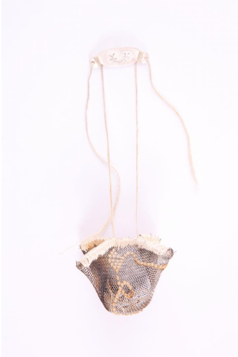
Figure 6. Joani Groenewald, Teesiffie #3 (2013). Brooch: Lace, thread, silver, tea strainer, rooibos tea. Digital photograph.