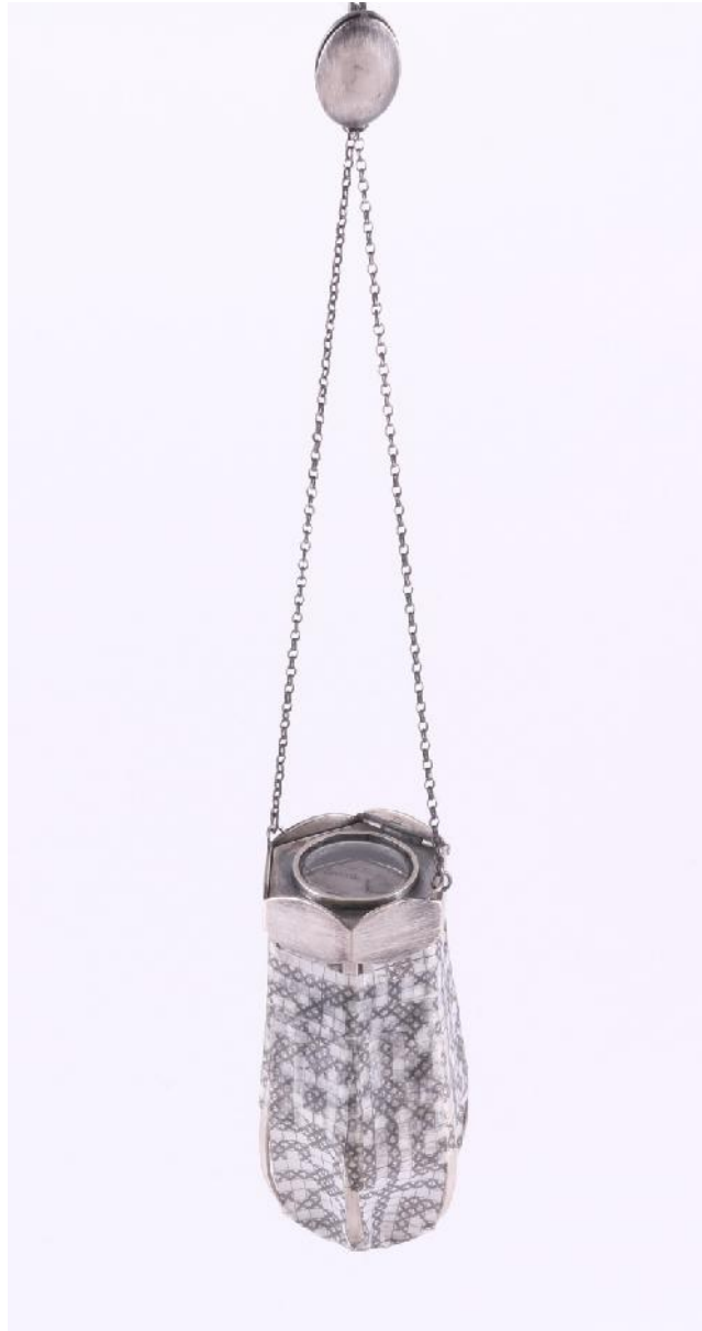
Figure 2. Joani Groenewald, Brooch (2014). Silver, paper and plastic. Digital photograph.