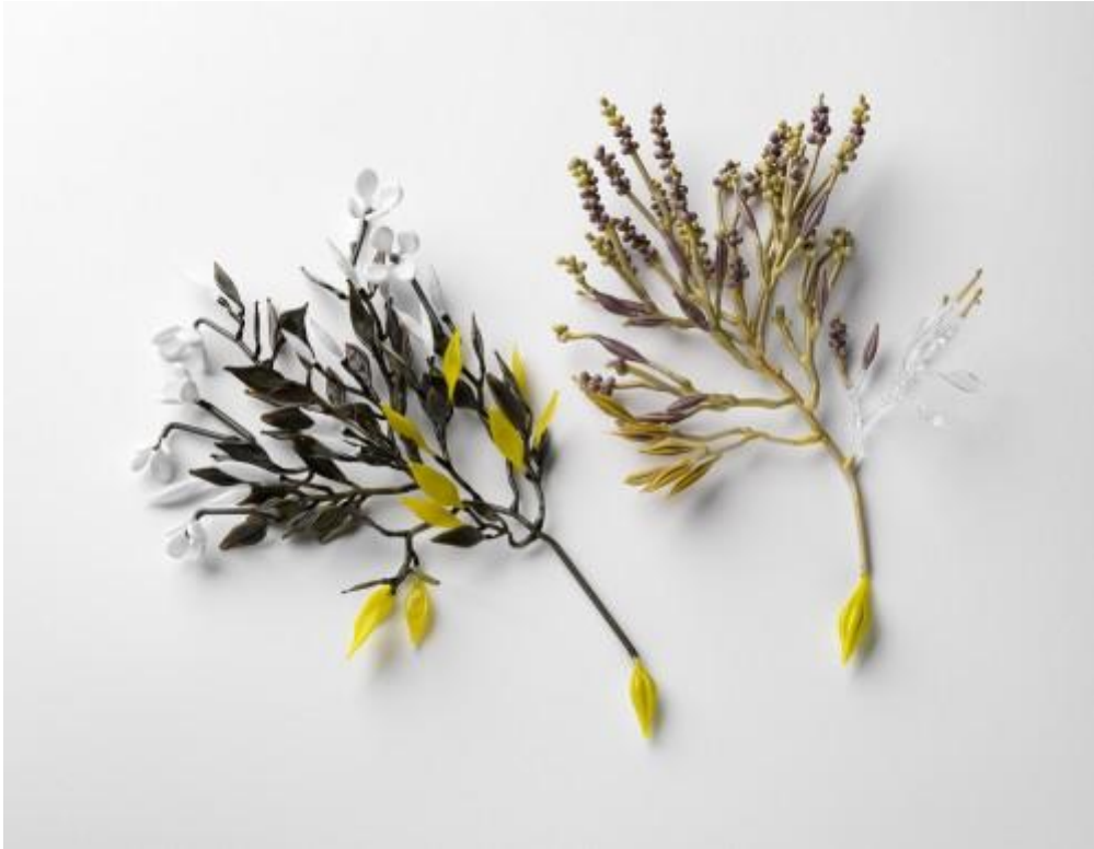
Figure 32: Jess Dare. Conceptual flowering plant series (2013). Object: Lampwork Glass. (Jess Dare [Online]).