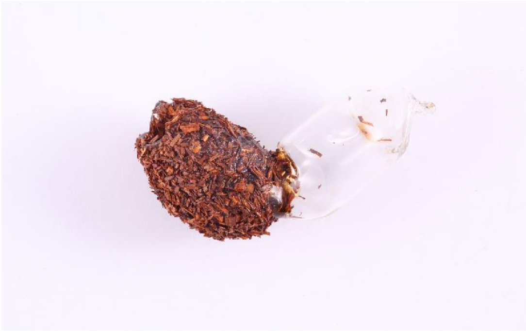
Figure 18. Joani Groenewald. Rooibos #1 (2014). Glass Rooibos tea. Digital photograph.