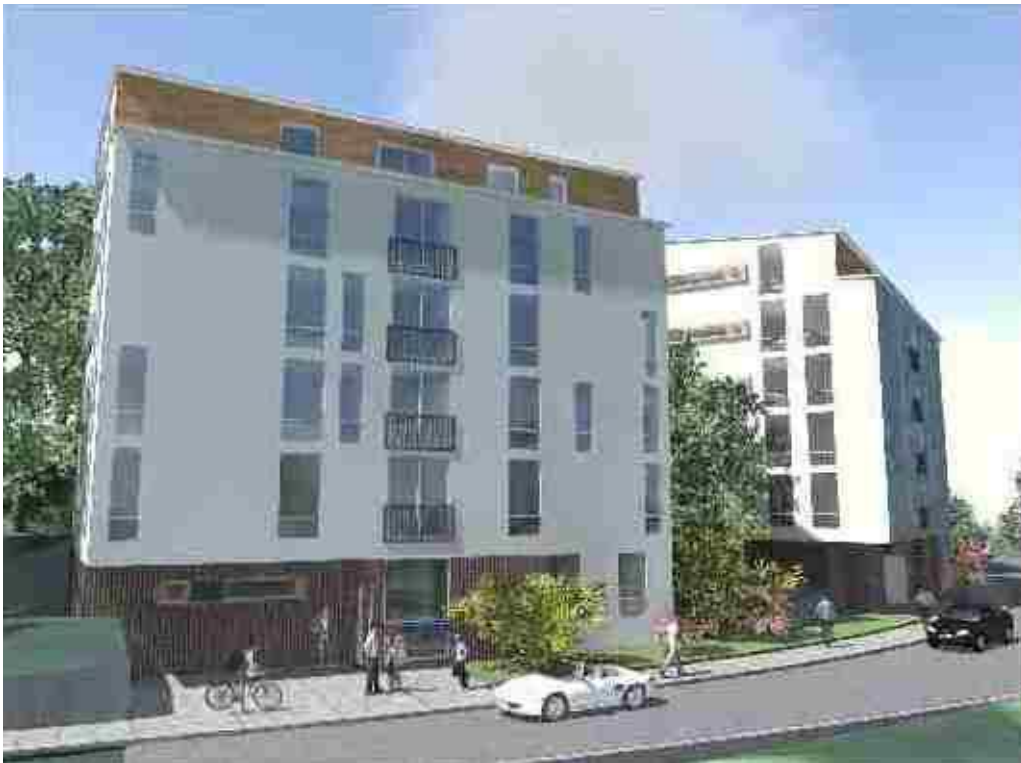
Img.11 , Houses on the western ridge as shown in the 2010 statement and 2011 plan. Six storeys total with an underground garage underneath the road with room for one car per flat.