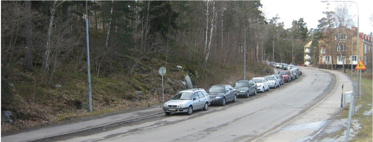
Img.3 , Stora Mossens Backe on a Monday morning after the rush. To the left in the picture lies the eastern ridge and to the right the far end of Eldhund with the day care centre on the ground floor.