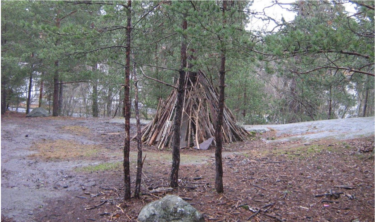
Img.5, A makeshift playhouse on the plateau on the western ridge.