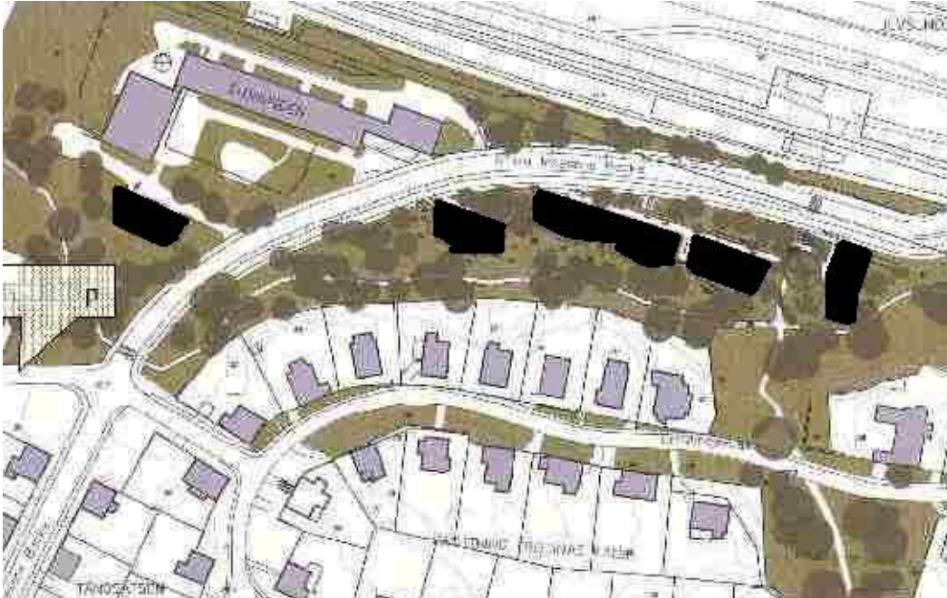
Img.8 , The plan as it appeared in the 2009 memorandum, with the planned developments in black.