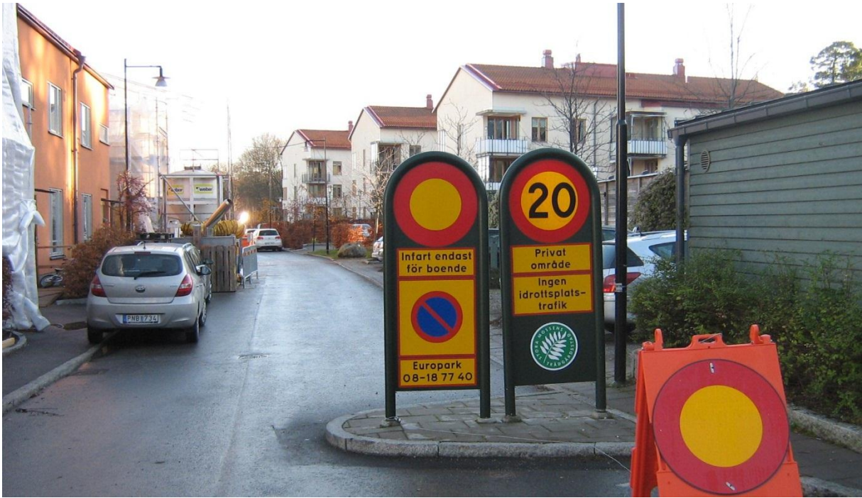
Img.7 , The blocks next to the sports centre, finished in the early 2000's and built mostly in the lamellar style. These residences were not part of the study.