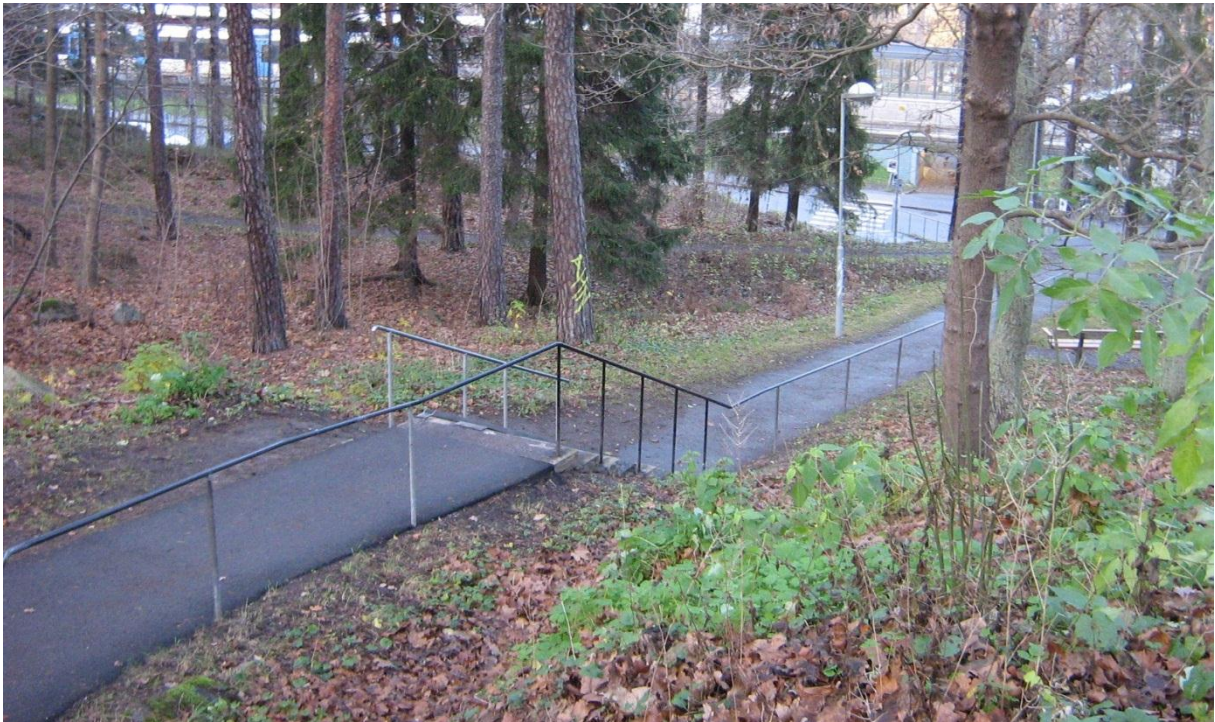
Img.4 , The stairs on the eastern ridge.