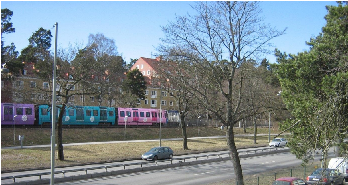
Img.2, Eldhund and an underground train seen from the other side of Drottningholm road.