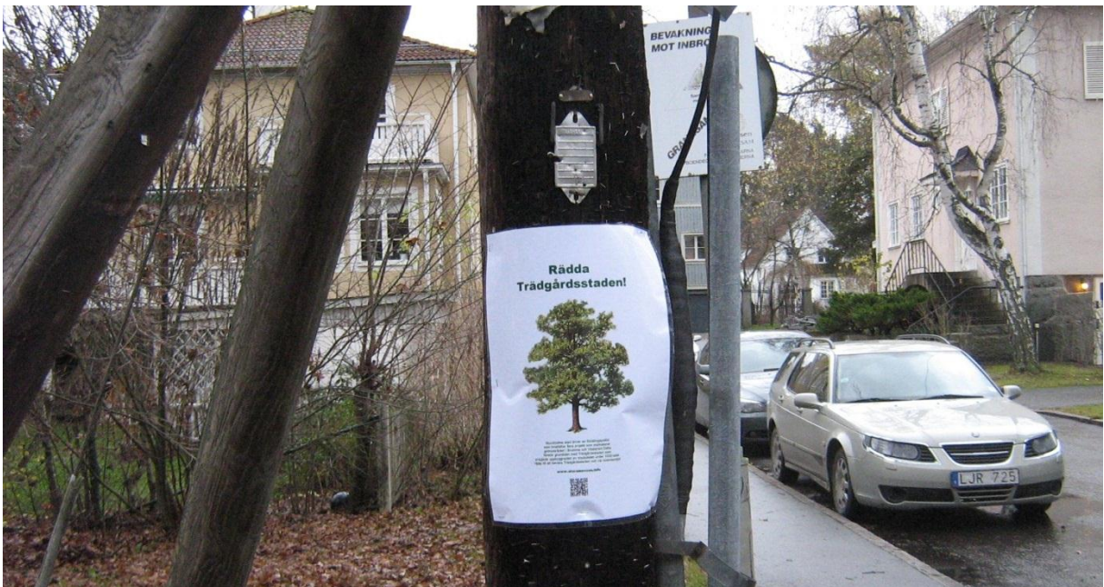
Img.6, "Save the garden city!" Notice posted by Stora Mossens Vänner on Ermine Path.