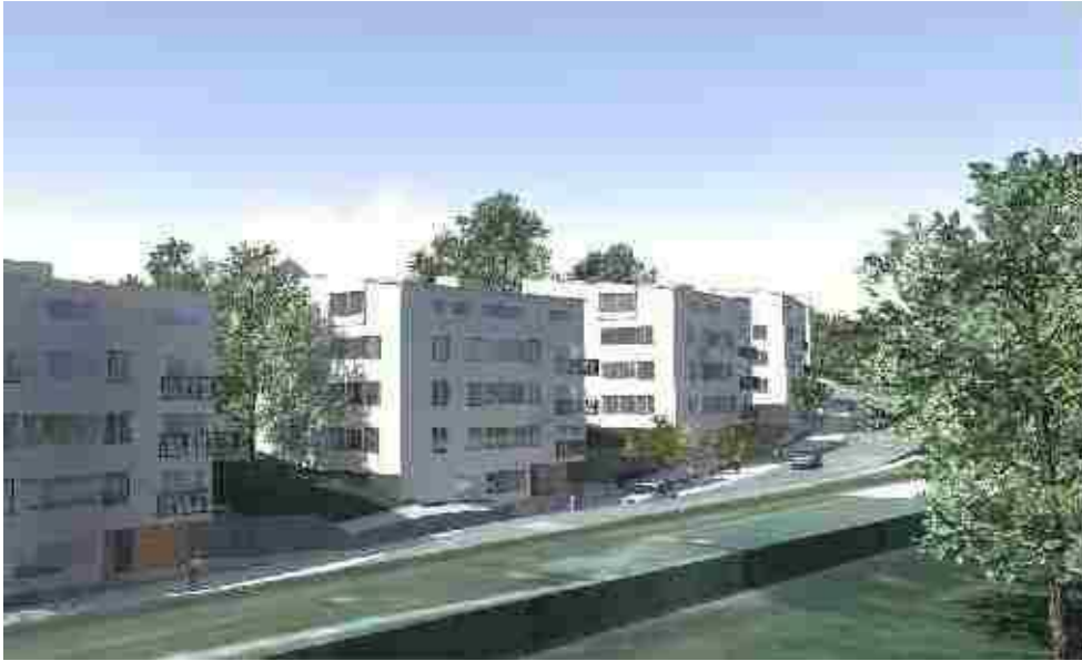
Img.10 , Houses on the eastern ridge as proposed in the 2010 statement and 2011 plan. Five storeys total with the bottom floor reserved for commercial purposes.