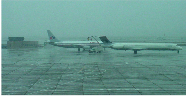
FIGURE 8 Aircraft are de-iced at a remote deicing pad during inclement weather at DTW.