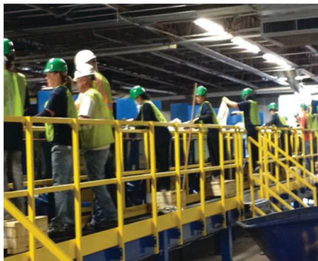
FIGURE 7 Workers at CLT’s Recycling Center sort waste through a conveyor operation.