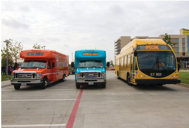
FIGURE 1 DFW employs an asset management system to manage its fleet assets.

and replacement parts can be combined to determine the operational cost per mile or cost per hour for individual assets. Efficiency of maintenance activities can be measured in terms of preventative versus corrective maintenance, parts versus labor, and timeliness of maintenance tasks completed. Access to this combined data set enables the analysis required to make long-term operational and capital budgetary decisions with regard to repair, redistribution, redeployment, and replacement of vehicle assets.