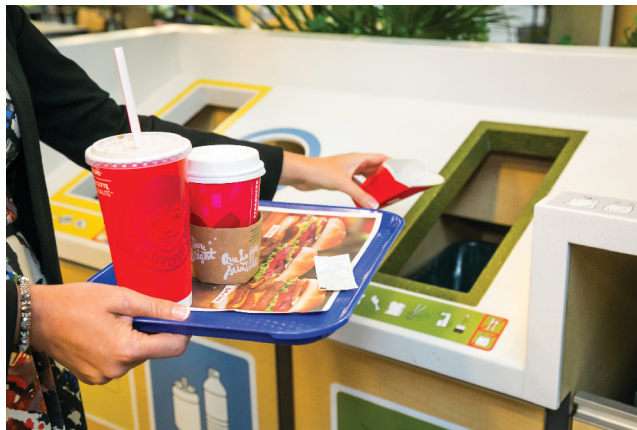
FIGURE 9 Composting collection alongside waste and recycling in a food court at YVR.

often not local and are not acquainted with the requirement to divert their waste. A waste audit and survey indicated that patrons do have difficulty sorting their waste, and so additional support staffs were brought in at peak times to help with sorting at the food court waste receptacles. Because the airport has a substantial number of non-English speaking patrons, YVR opted for the use of pictograms, as opposed to language, to explain diversion at the waste receptacles (Figure 9).