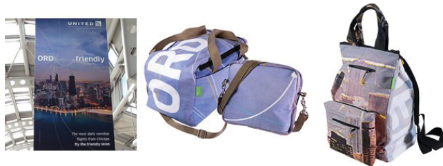
FIGURE 10 Obsolete marketing signage at ORD is transformed into high-end travel bags.