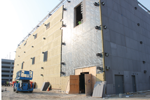
FIGURE 3 A substation was designed to a higher design flood elevation at LGA to alleviate flood risk.