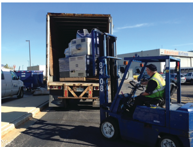
FIGURE 5 American Airlines collects e-waste for donation to Recycling Avenues (Source: American Airlines).

American Airlines also partners with Avenues to Independence, a work center for adults with disabilities in the Chicago region. One of Avenues to Independence's programs is Recycling Avenue, which provides employment for disabled adults while keeping toxic electronic waste out of the