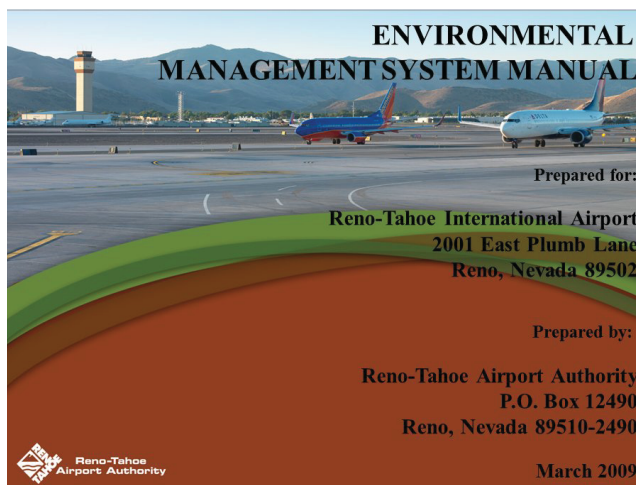
FIGURE 2 RTAA’s EMS Training Manual (Source: Reno–Tahoe Airport Authority).