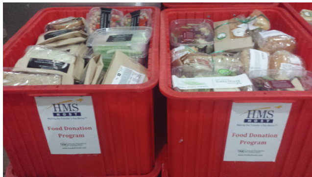
FIGURE 6 HMSHost collects surplus packaged food for transport to local food banks.

HMSHost has been donating food to local food banks since 1992, and in 2014 it contributed more than 1.8 million food items across the country.