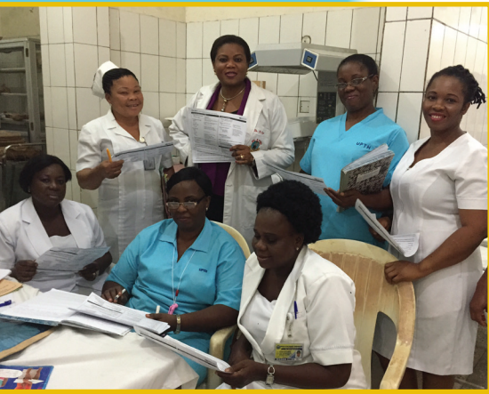
Labor Ward staff in Nigeria's University of Port Harcourt Teaching Hospital meet to discuss their checklist implementation project.

details of medical and surgical care—and adaptive ones, which go beyond simple adoption of techniques and address broader questions such as context setting, human psychology, and sociological issues. A common mistake “is to treat an adaptive problem as a technical one.” But in truth, it took both aspects of puzzle solving—the technical (medical science) and the adaptive (social science)—to make checklists work. “The science must be robust,” he wrote, “yet it must address values, beliefs, and attributes of the group involved.”