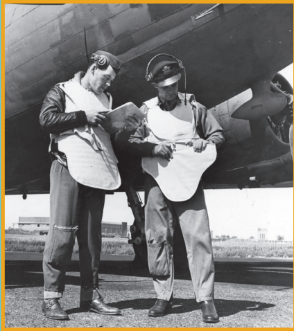
World War II aircrew wearing flak vests prepare to fly a Boeing B-17 on a bombing mission.

In his book, The Checklist Manifesto: How to Get Things Right , Gawande made the analogy to another high-stakes situation, the introduction of the massive Boeing B-17 bomber shortly before World War II, a machine so complex it was nearly shelved as “too much airplane for one man to fly.” It was indeed a lot of airplane; it involved so many steps and maneuvers that it was easy for pilots to forget something important, with possibly devastating consequences. But after test pilots developed a simple checklist to itemize each step needed for taxiing, takeoff, flight, and landing, the prevailing narrative about the B-17 changed and it was viewed as practically crash-proof.