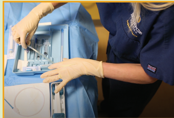
Checklist pilot program in the Johns Hopkins Hospital surgical ICU; a nurse unpacks a central venous catheter kit.