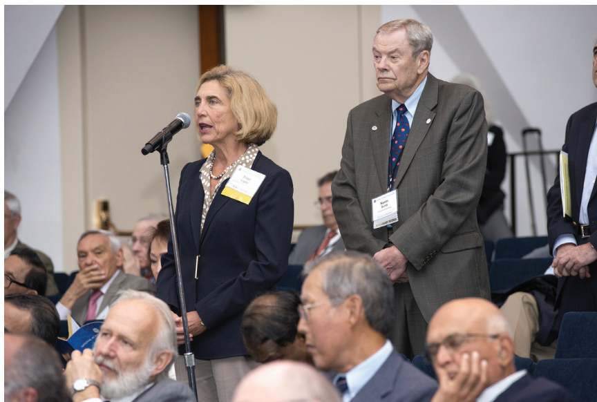
Audience members queue to participate in the postforum discussion.