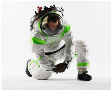
FIGURE 4 Z-2 suit design with luminescent patches.