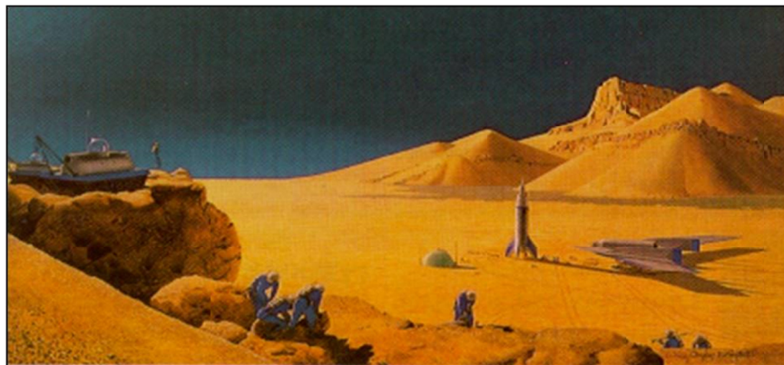
FIGURE 3 An illustration from Exploring Mars by Chesley Bonestell, 1956.

The major issues missing are the discussions of task-analytic data (a deficit shared by other NASA evidence reports) and discussion of an alternative to conventional EVA suit design. Additional gaps include discussions regarding the mechanisms for mitigating the effects of pressure-suit punctures and the effects of physiological deconditioning on human performance during EVAs in pressure suits. In the absence of task-analytic data, details are not available on the work that will be performed on the surfaces of asteroids and Mars; however, it is reasonable