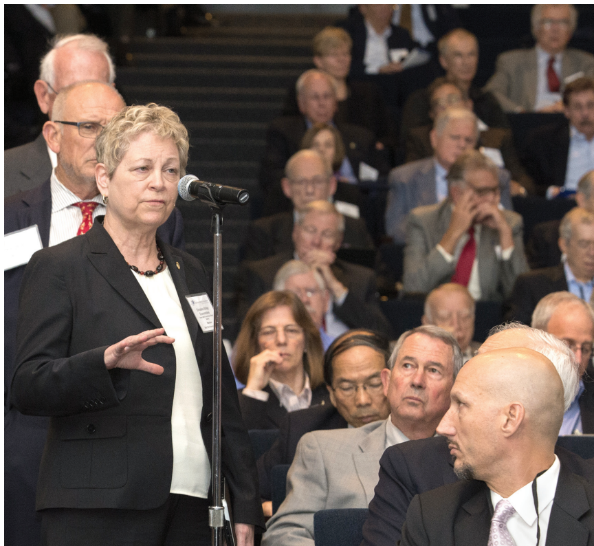
Audience members queue to ask questions during the panel discussion.

engineers sitting in the audience and elsewhere around the world will help determine what happens during those next 50 years. “For me, this is just talk. For you, you have some influence.”