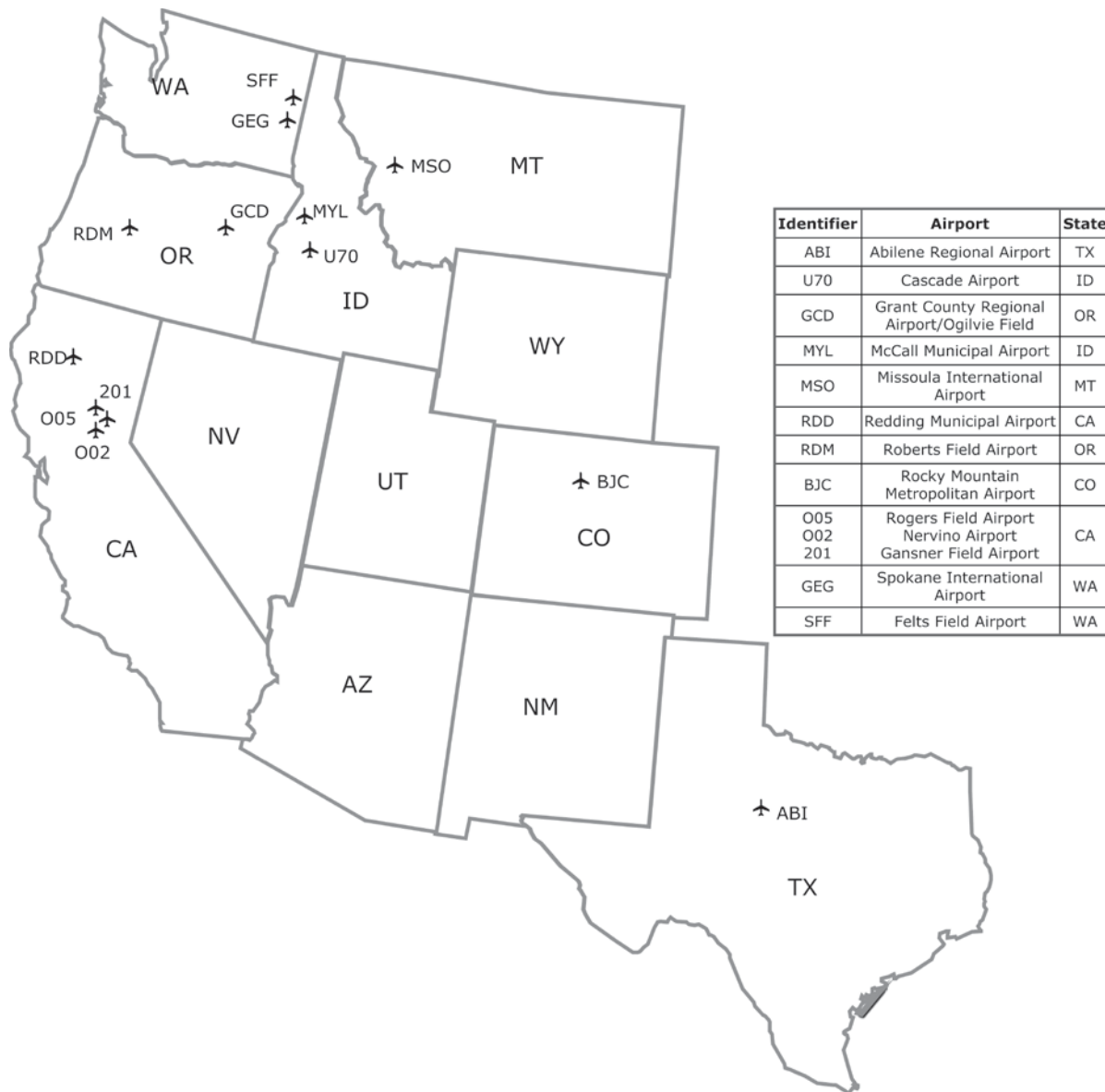
FIGURE 6 Location of airports where airport operator interviews were conducted.

cache of firefighting materials, a fire science laboratory, tanker and smokejumper aircraft, a retardant mixing/loading facility, and a museum. MSO is also the home base of Neptune Aviation Services, one of the largest fixed-wing aerial firefighting air tanker businesses in the United States, operating a large fleet of P2V aircraft.