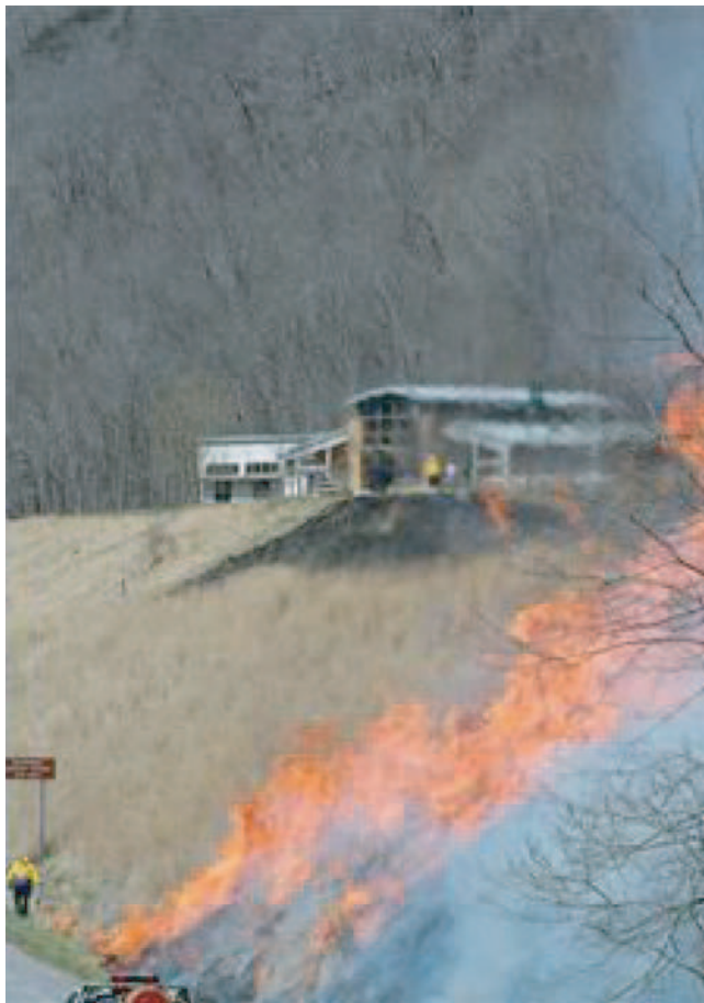
FIGURE 1 Cabin and ground fire.

members of the industry; that is, airport managers, aircraft operators, and base operators. A series of questions designed to guide the discussion was developed and tested on the three airport operator members of the topic panel; the test interviews allowed the principal investigator to sharpen the focus of the questions. Additionally, two helicopter operators (one Type I and one Type II) were interviewed to gain user perspectives. One USFS base operator was interviewed, whereas several declined to be interviewed, citing USFS policy on outside interviews. A copy of the interview guides are in Appendix A.