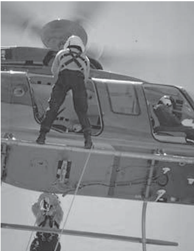
FIGURE 9 Helicopter rappel (National Park Service website).

Siskiyou Rappel Crew (Oregon), Sled Springs Rappel Crew (Oregon), Teton Interagency Helitack (Wyoming), and Wanatchee Valley Rappellers (Washington).