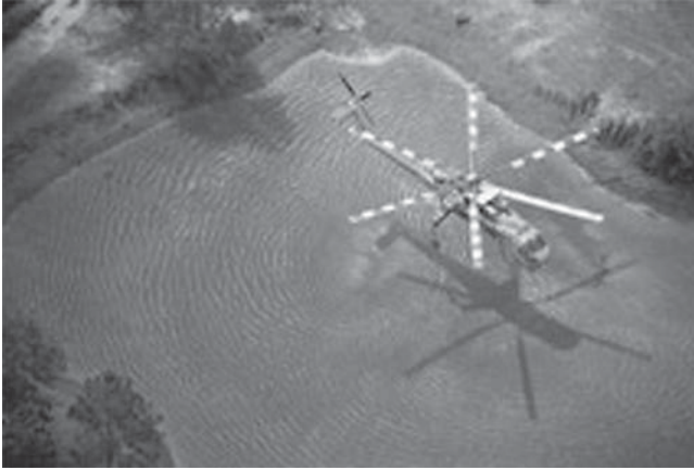
FIGURE 8 Type I helicopter (USFS website).