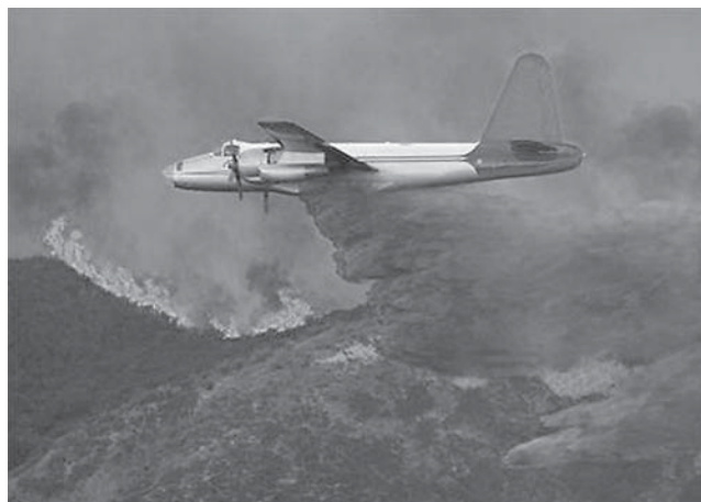
FIGURE 5 P2V Neptune.

Approximately half of the operators interviewed reported at least some minor damage to airport facilities during or resulting from aerial wildfire suppression efforts. Damage ranged from runway and taxiway lights destroyed (aircraft taxiing over the lights) to destruction of a fence when a P2V (see Figure 5) lost its hydraulic brakes and a ramp that sustained damage when a fully loaded P2V got "lost" and taxied onto a ramp rated for