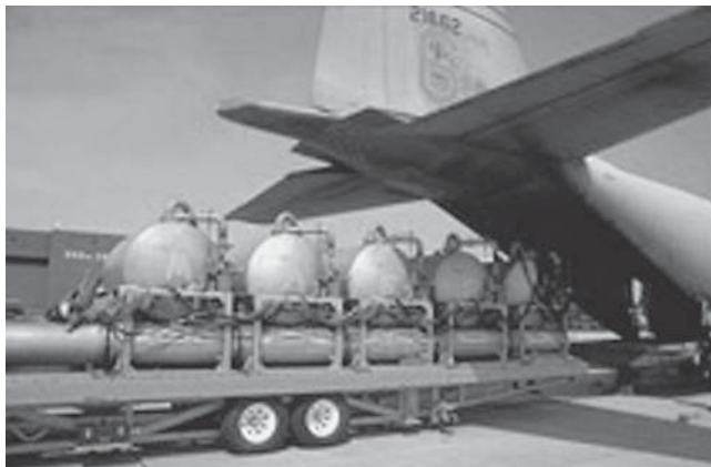
FIGURE 7 Mobile Aerial Fire Fighting System (MAFFS) (USFS website).

permanent facilities had been developed were active seasonally depending on the nature of the fire season in the area.