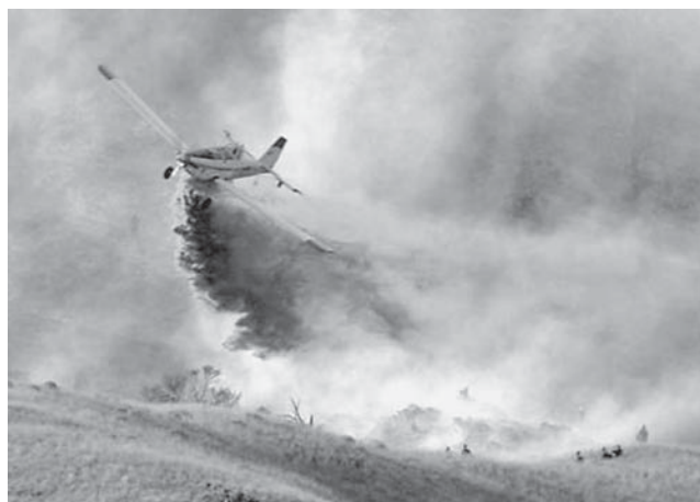
FIGURE 10 Single engine air tanker (SEAT).

Half of the airports interviewed had established procedures for the jettisoning of retardant on airport property (see Figure 10). Other airport operators indicated that they lived in areas where the pilots could pick an area to unload, and it would cause no problems; in other words, the areas were remote. Two airports stated that they expressly prohibit the practice of jettisoning retardant on airport property except in emergency situations. Several airports experienced accidental discharges of retardant, but no serious problems were encountered. Where