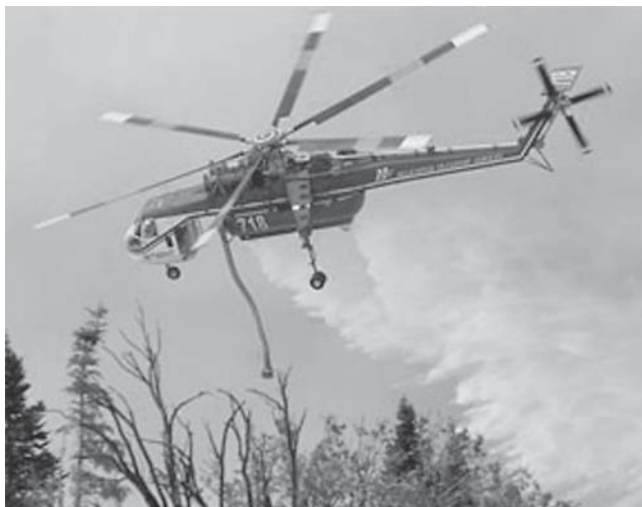
FIGURE 4 Type I helicopter (NIFC website).

ATCT consider posting a notice in the airport/facility directory (A/FD) noting the likelihood of aerial wildland firefighting operations, as appropriate. An example of an A/FD entry from McCall Airport, Idaho, obtained online [ http://www.airnav.com/airport/KMYL (accessed Aug. 16, 2011)] follows: