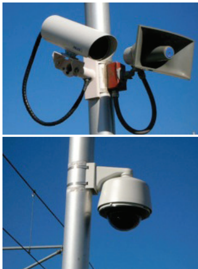
FIGURE 5 Fixed cameras (top) are being replaced with pan-tilt-zoom (PTZ) cameras (bottom). PTZ cameras provide greater surveillance coverage because they can pan (move left and right), tilt (move up and down), and zoom in or out.

Despite opening for revenue service with a well-designed video surveillance system, Metro Transit has been upgrading its system almost since its inception. The initial system was based on almost 130 cameras that were installed at the 17 original stations and two parking lots. The at-grade and elevated stations have canopies and windscreens and overhead radiant heaters. Each station is furnished with emergency call boxes, maps, information kiosks, public art, and benches. Fare collection is a self-service, barrier-free proof of payment system that is checked periodically by Metro Transit police officers. Each station, with the exception of large facilities (i.e., Mall of America, Lindbergh Airport Terminal, and Lake Street Station) was designed with four cameras per station. Cameras also monitored the portals into the tunnels on S. Hiawatha and Minnehaha and at the airport. With the exception of one pan-tilt-zoom camera (Figure 5) at Fort Snelling, all others were fixed-position cameras.