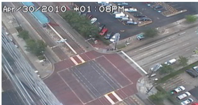
FIGURE 6 The photo represents Houston METRO's plan for installation of video analytics to detect illegal left turns by road vehicles into the LRV's right of way.

A number of safety improvements, including new signage, better signal layout, public education, and media attention to the problem, contributed to reducing the number of incidents involving road vehicles and LRVs. The use of analytic video adds another layer of protection to riders in both the railcars and other vehicles as well as to pedestrians, who may also be injured if accidents occur (Figure 6).