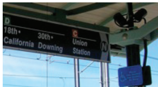
FIGURE 3 Denver's RTD places cameras near handicapped access ramps.

Houston METRO is one of a large number of agencies that monitor park-and-ride facilities to prevent a variety of crimes, including vehicle thefts and thefts from vehicles. Cameras also can be used to observe that patrons are not annoyed by panhandlers or do not become the victims of more serious crimes. Staff members who are monitoring the cameras are often able to communicate with drivers in the parking facilities and to control a number of lots' electronic gates through their central operations center (Nakanishi 2009, p. 23)