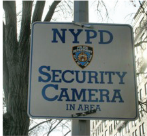
FIGURE 4 The New York City Police Department posts signs on local streets indicating the presence of security cameras. This sign was across the street from a Manhattan subway station.

The use of surveillance in the United States is not as widespread as it is in the United Kingdom, but it has been steadily expanding. It is not unusual for newspaper readers around the nation to see stories about their cities increasing their reliance on cameras for a number of crime prevention efforts. New York City, Chicago, Baltimore, and Pittsburgh are only a few of those whose mayors have spoken frequently on the issue, and many smaller cities have turned to cameras without the fanfare and publicity of these larger municipalities (Figure 4). Announcements of transit agencies' expansion of their surveillance networks also receive local attention from the media.