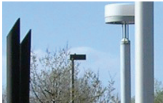
FIGURE 2 Cameras are often placed adjacent to stations near malls, tourist attractions, or college campuses. This camera placement at the light rail station near Denver's Metropolitan College campus is designed to blend into campus design elements.

Outdoor parking facilities in areas without extreme climate changes may be fairly easy to protect, but indoor multistory lots require more planning than merely placing cameras anywhere on any floor. Denver's RTD, for instance, places its cameras so that the areas under observation include elevator waiting areas and emergency telephone locations, among others (Figures 2 and 3).