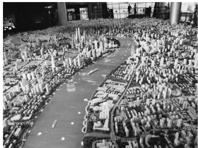
Figure 3 A room-sized model at Shanghai’s Urban Planning Exhibition Hall depicts all current and planned structures for the city.

The normal metrics and concepts of transport planning are generally not applicable to Shanghai because of its unparalleled growth (Figure 3). While most world cities are concerned with sustainable growth and limits to further decentralization, Shanghai is encouraging numerous satellite cities and rapid suburbanization. The market for the transit system being built is intertwined with the city’s expansion and land that is being developed along railway lines. However, the market segmentation of transit versus auto users is not well defined in relation to the mix of residential, commercial, and business centers that compose the long-term city development plan. Despite these factors, quickly reaching the capacity of the transit sys-