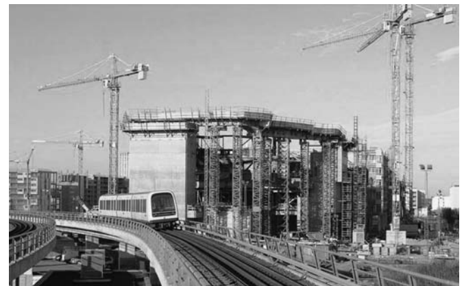
Figure 7 Copenhagen metro train passes through the new town of Orestad, part of the region's innovative financing strategy for the metro.

Prices for residential and commercial sites, which are set by the corporation and are based on market trends, were 2,800 kroner/m 2 at the end of 2004. By March 2005, the corporation had raised site prices to 3,100 kroner/m 2 .