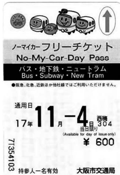
Figure 4 Osaka’s No-My-Car-Day Pass encourages ridership by allowing unlimited rail, tram, and bus trips on a single day for a flat fee.

Surutto Kansai officials predict the IC cards will increase use of public transportation, help maintain the fare-box ratio, enable shops to expand their customer base without having to invest in additional parking