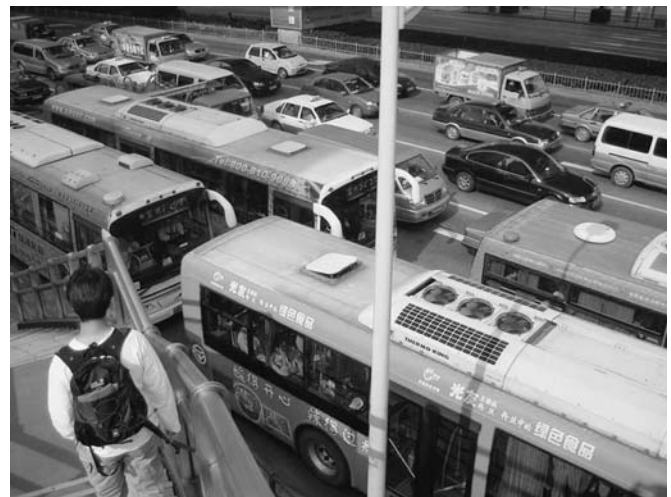
Figure 1 Roadways in the Central Puxi area of Shanghai are congested during peak travel hours.

Shanghai's public transportation system features buses as well as heavy and light rail. The system is run