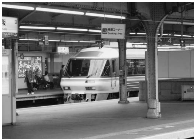
Figure 5 A commuter rail train pulls into the station in Osaka.

The capital cost for the design, planning, and construction of the tram system was approximately 548 million euros. All capital financing for the two tram projects—Trambaix and Trambesòs—came from private sources. The TM consortium provided 12% of the capital, and bank financing provided the remaining 88%. Project risks were shared by the private consortium members and governmental entities according to risk category. By entering into an agreement with