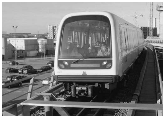
Figure 2 Copenhagen’s 22-station, 13-mile metro system uses driverless train technology.

To ensure that service quality and operation efficiencies are maintained, the operating contract includes incentives and sanctions. The contractor is penalized for operation and maintenance problems or for not achieving the on-time performance target of