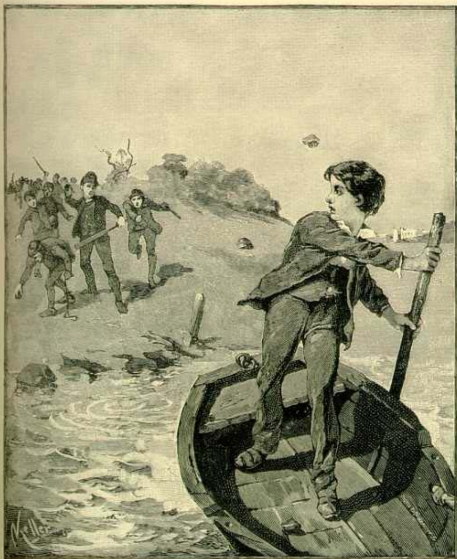
THE WAR BEGUN.