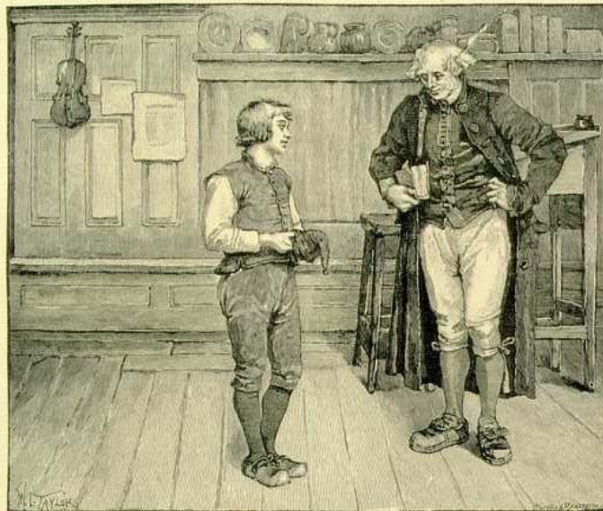
NILS ASKS THE SCHOOLMASTER FOR HIS FIDDLE.