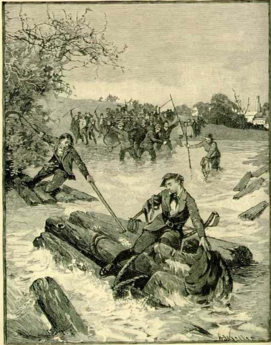
THE BRAVEST BOY IN NORWAY.