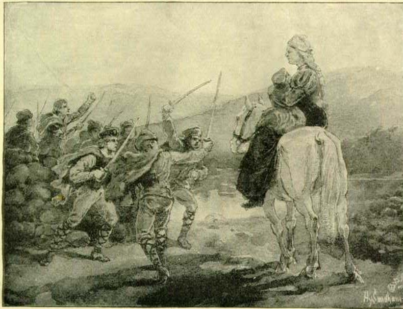
THE SONS OF THE VIKINGS RUSHED FORWARD.