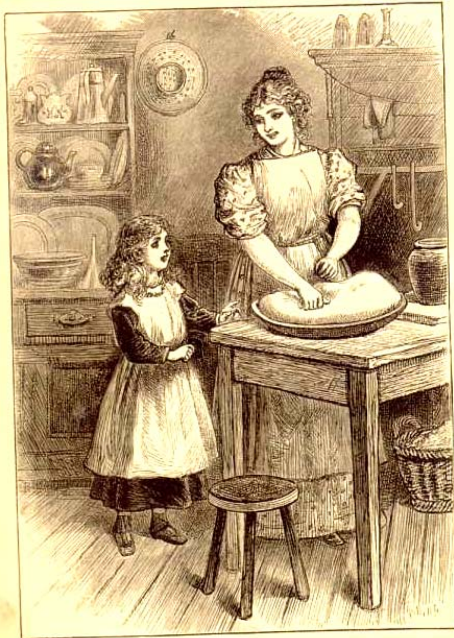
THE PARSON'S DAUGHTER.

"Oh, Nabby, Nabby! do tell me what they are doing up at your church. I've seen 'em all day carrying armfulls and armfulls—ever so much—of spruce and pine up that way."—p. 8.