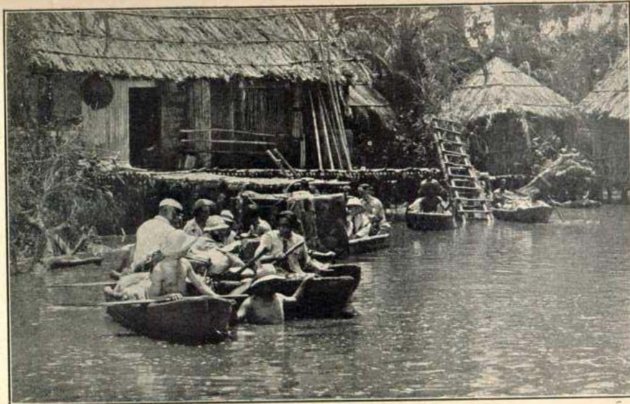
Prof. Challenger (Wallace Beery) takes charge of the dangerous expedition up the Amazon. (The Lost World) (A First National Picture)