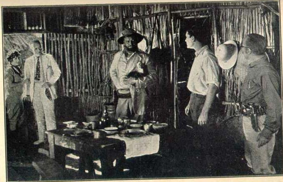
Another one of the professor's outbreaks. Paula White (Bessie Love), Sir John Roxton (Lewis Stone), Prof. Challenger (Wallace Beery), Edward Malone (Lloyd Hughes), and Prof. Summerlee (Arthur Hoyt). (A First National Picture)

Another one of the professor's outbreaks. Paula White (Bessie Love), Sir John Roxton (Lewis Stone), Prof. Challenger (Wallace Beery), Edward Malone (Lloyd Hughes), and Prof. Summerlee (Arthur Hoyt). (The Lost World) (A First National Picture)