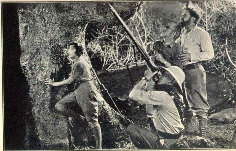
A midnight alarm awakens Paula White (Bessie Love), Sir John Roxton (Lewis Stone), Prof. Summerlee (Arthur Hoyt), and Prof. Challenger (Wallace Beery). (The Lost World)