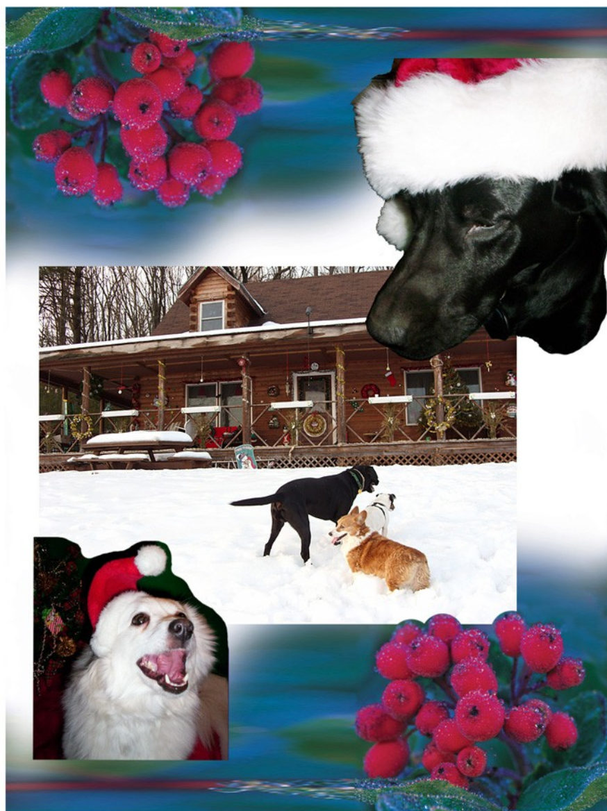
Snowy and Ravy wear Christmas hats. Santa would be proud!

And that's not all. For starters, all four will probably want to explore their newly covered surroundings. They usually like to wander about seeking new scents and being ever alert to new sounds or sights. Perhaps this year they will spot a flock of wild turkey or maybe discover the hidden secret place where a buck has been? And if they get a bit thirsty from all the up and down snow-covered hill climbing-no problem! There is water everywhere. Frozen water that is.