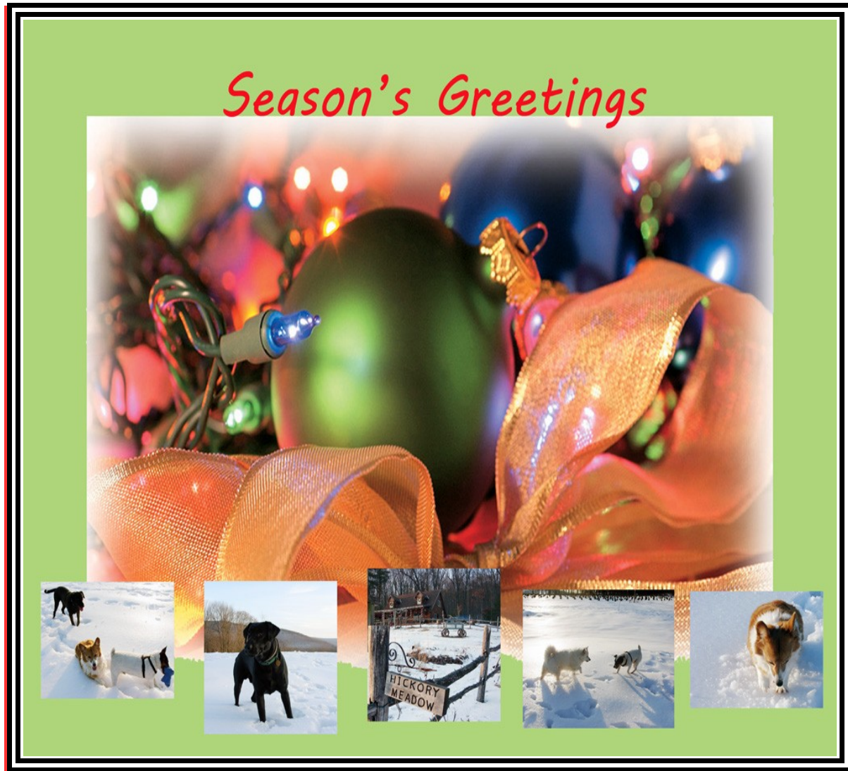
Ravy, Mr. Tails, Coconut & Snowy doing what comes naturally.

Sometimes the snow will harden on the surface but it will remain soft underneath. This top layer of icy snow can present some challenges for all 4 members of this pack. Icy snow is always tricky to walk on even if you happen to be a pack of four dogs with 16 legs combined!