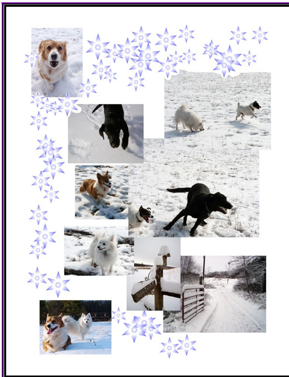
Can you tell Ravy is perhaps The Happiest in snow?

Snowy, Mr. Tail, Big Ravy and Coconut will be ready when snow finally arrives but what will they do with all this snow?