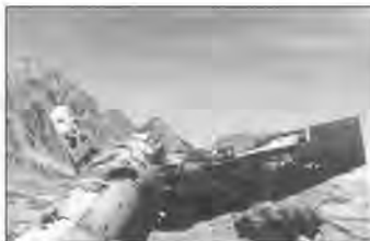
A photograph provided by the Siraji Ministry of Defense shows wreckage.