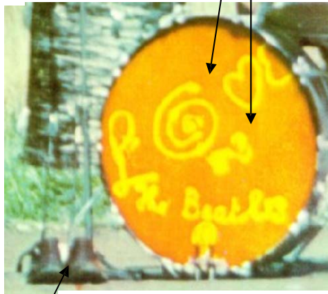
From insert of Magical Mystery Tour Album

“There's a fog upon LA and my friends have lost their way”